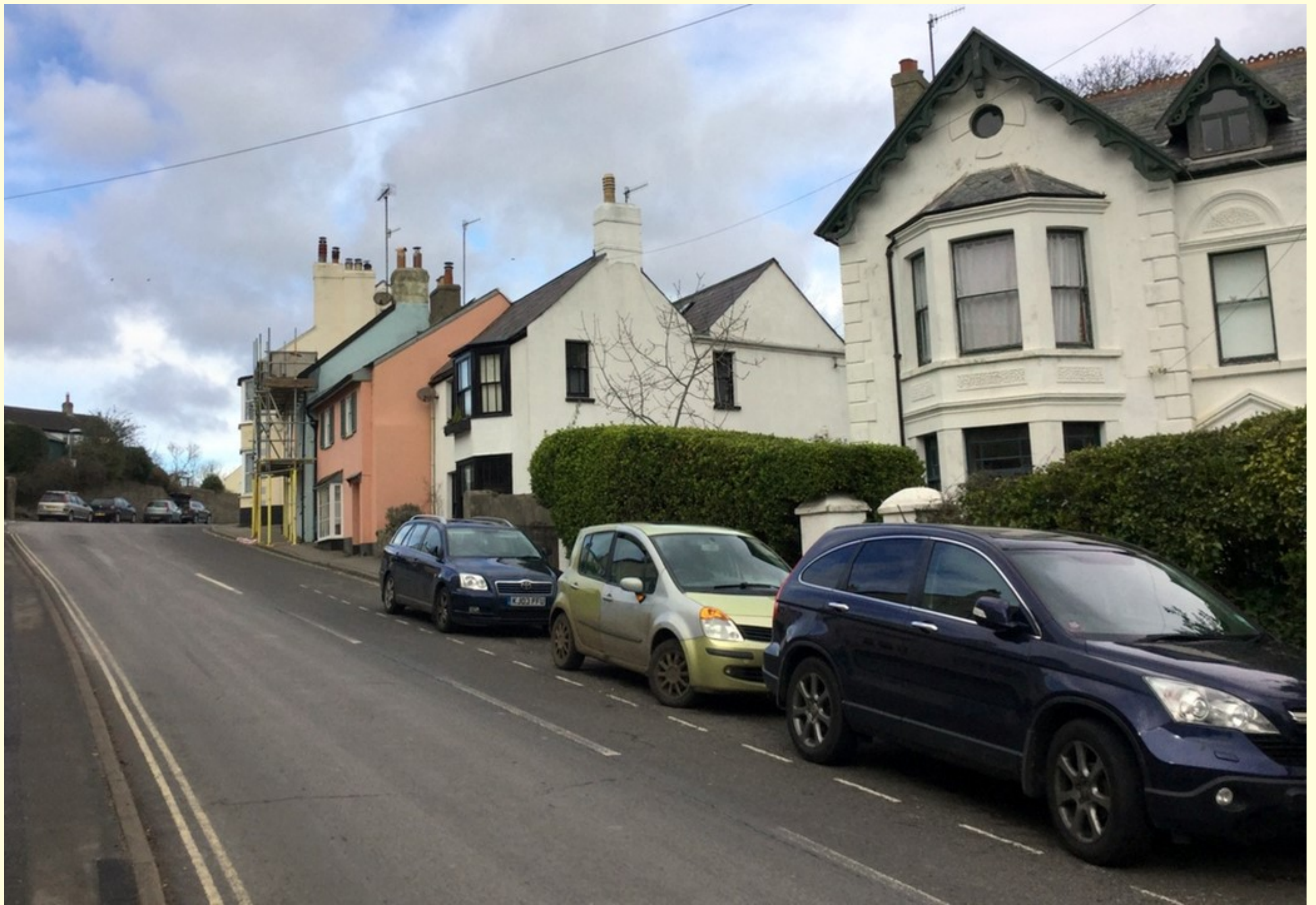
The same view today