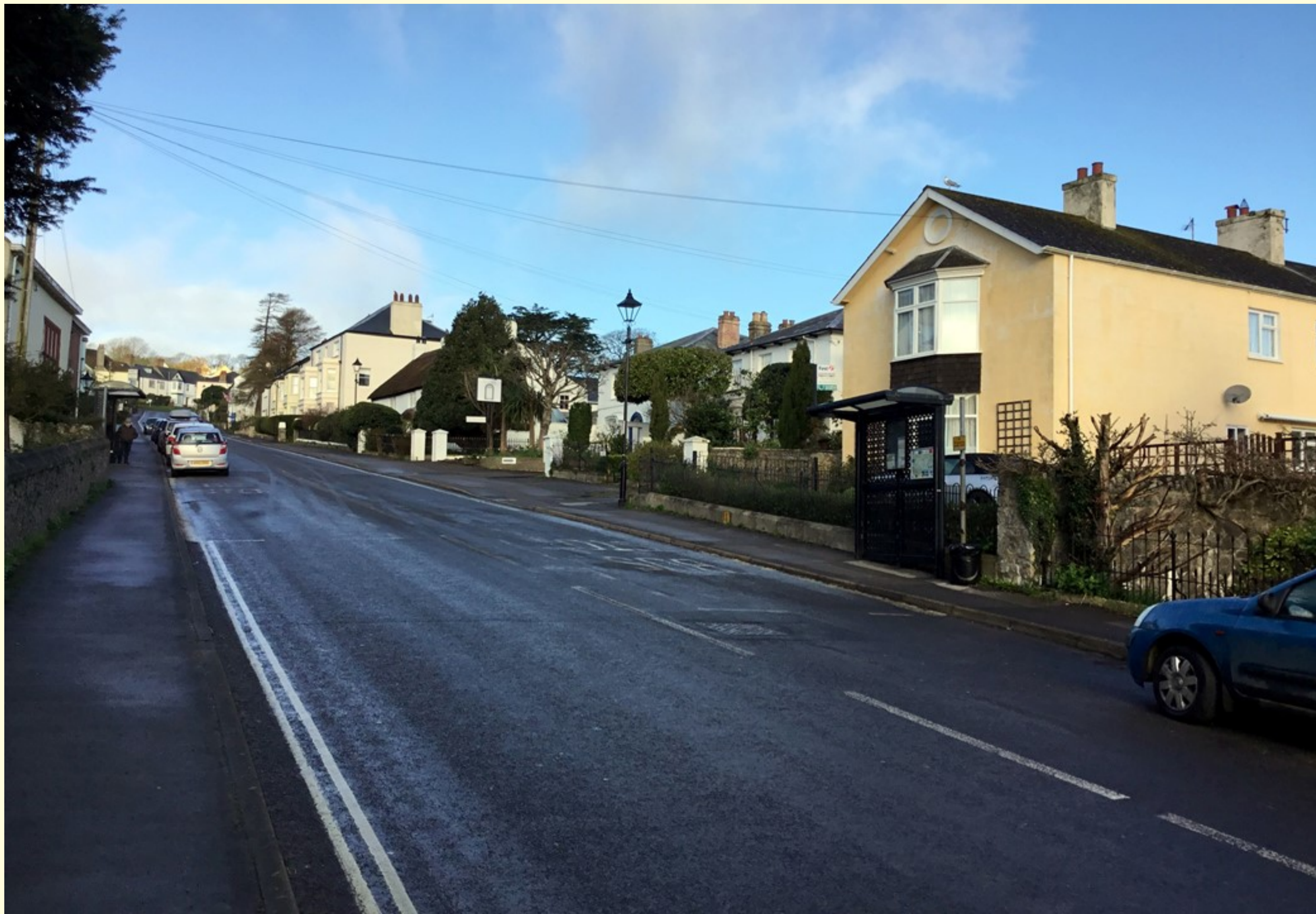
The same view today