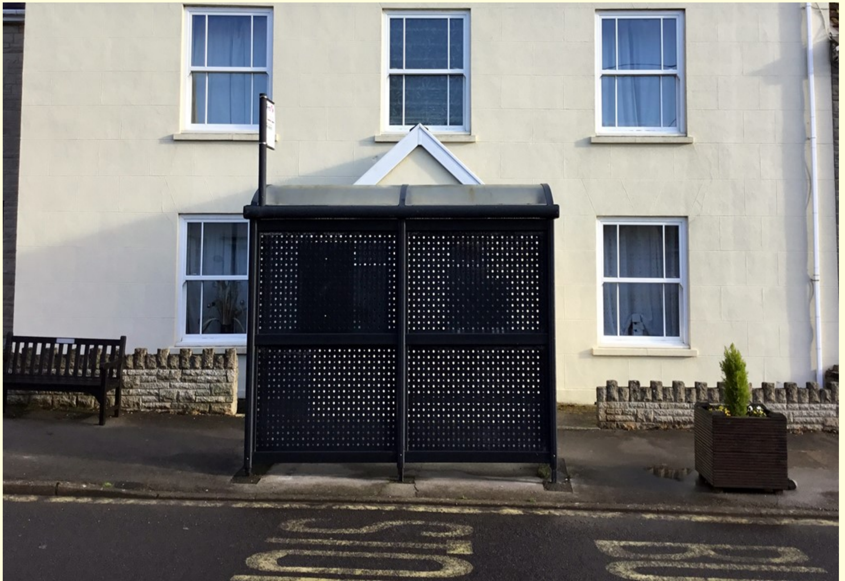
The same view today. Almost unrecognisable with the road height raised and a Bus Shelter now obscuring the doorway.