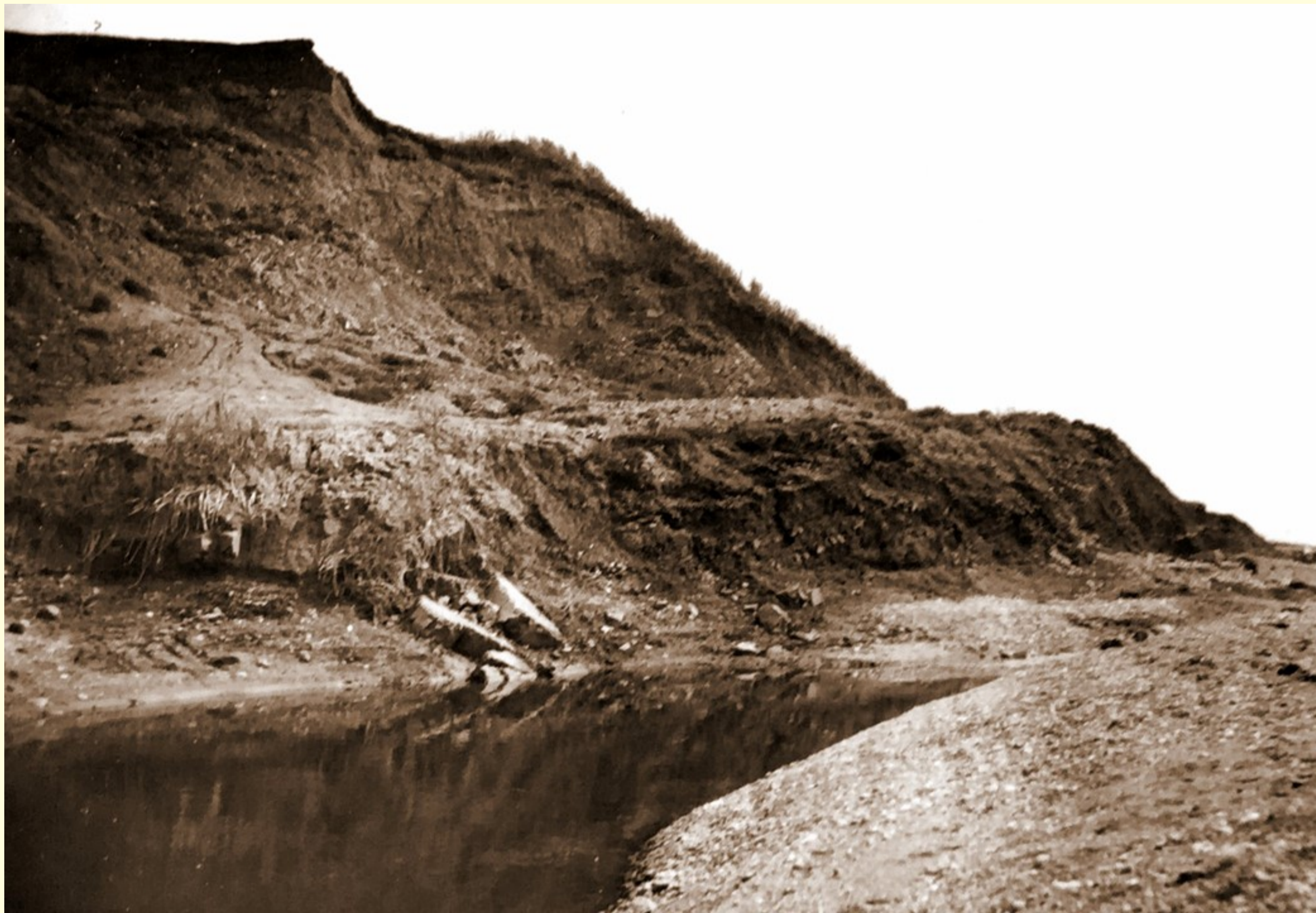
a simlliar photo.