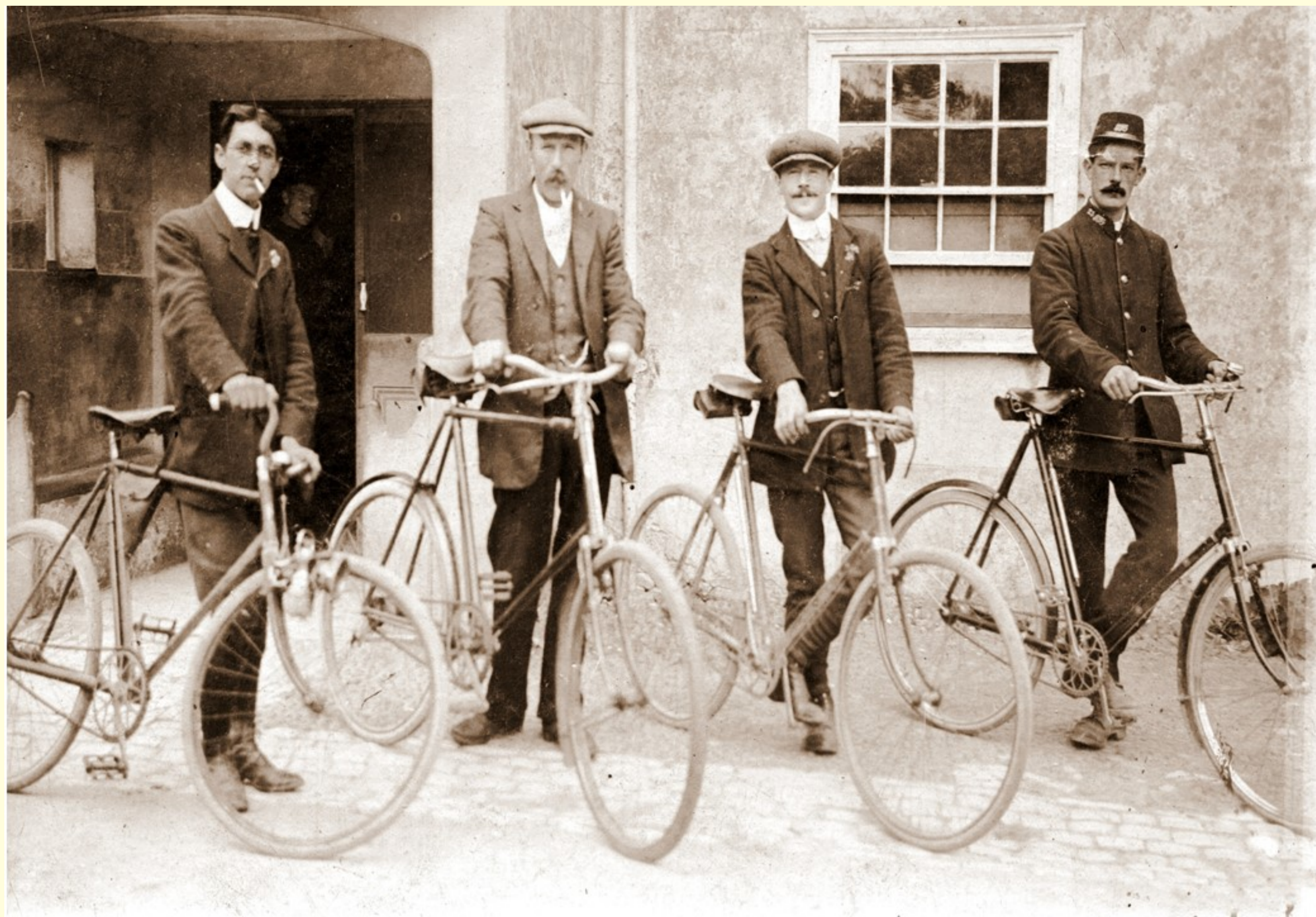
Four Edwardian cyclists setting out from The George in 1911.