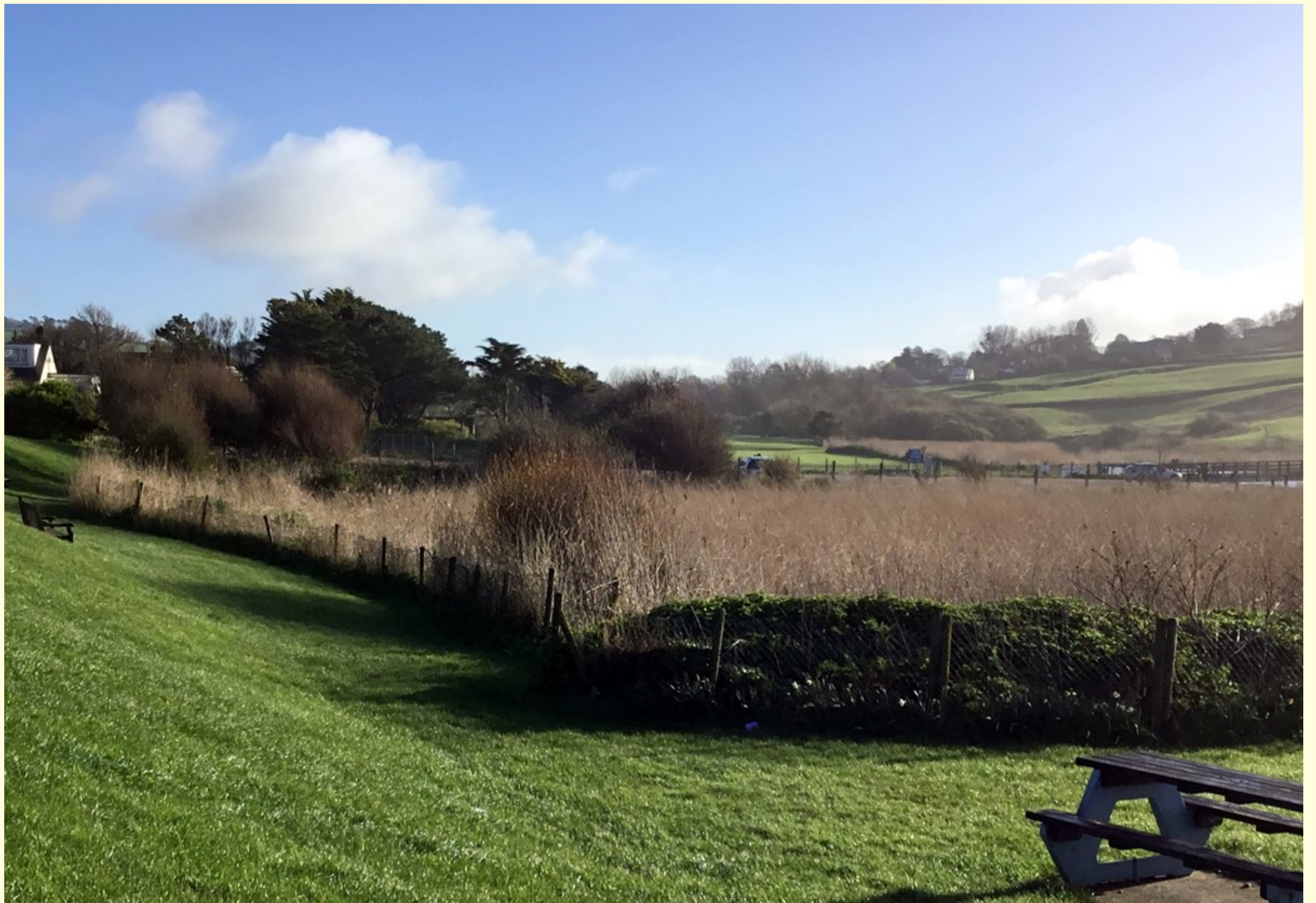
The same view today