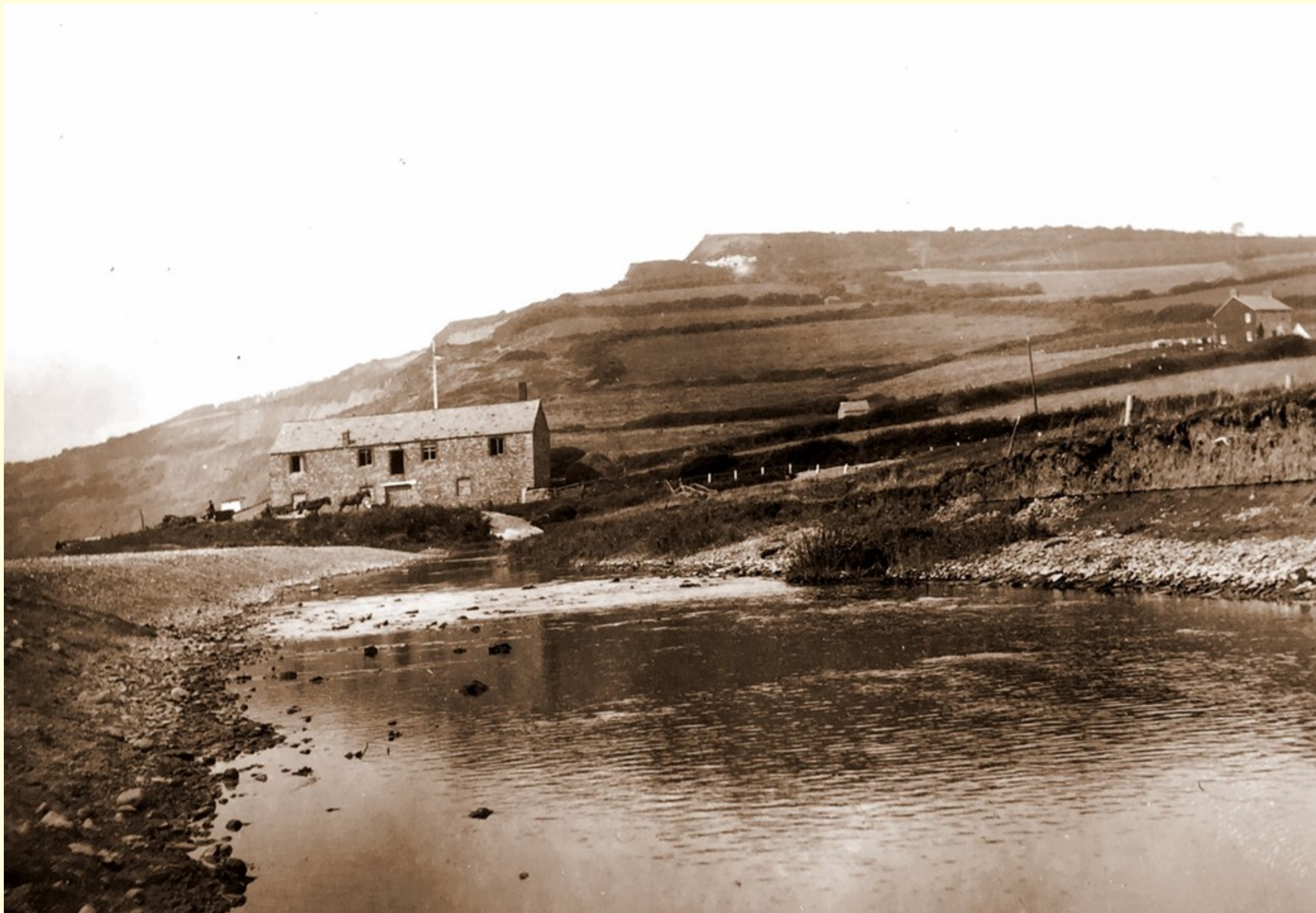
A line of horses wait outside the former Cement Works which was in a dilapidated state in 1911. The house on the right is Sanctuary Cottage and the former Battery used by The Coastguards stands in between. The former Oxbow in the River Char taking it close to Lower Sea Lane is clearly shown here.