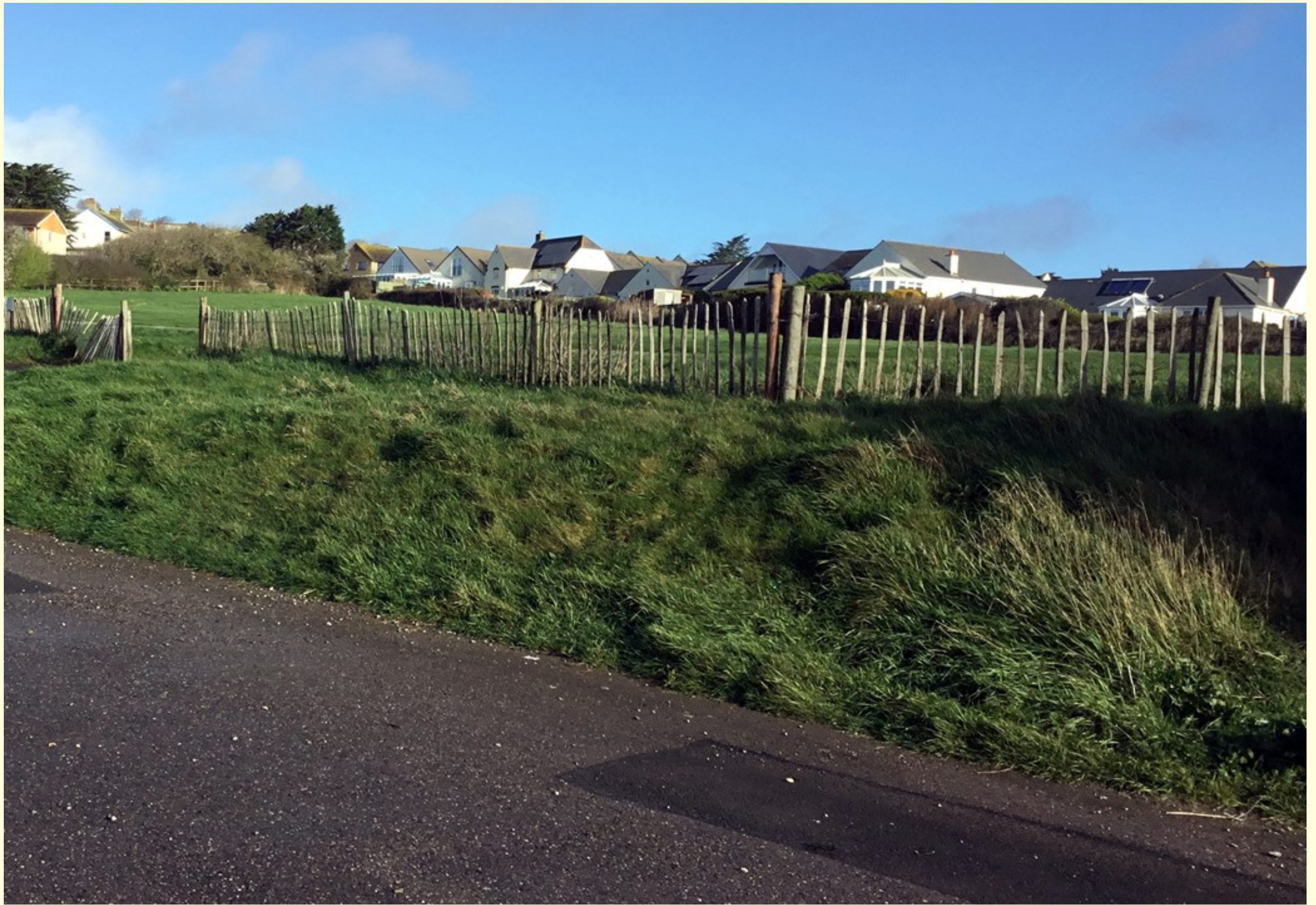
The same view today

A superb study of an encampment of Scouts where the car park is today. In the distance is Sanctuary Cottage and other houses in Higher Sea Lane. They were there for the investiture of the Charmouth Patrols by the County Commissioner, Colonel Colfox on 30th July 1914.