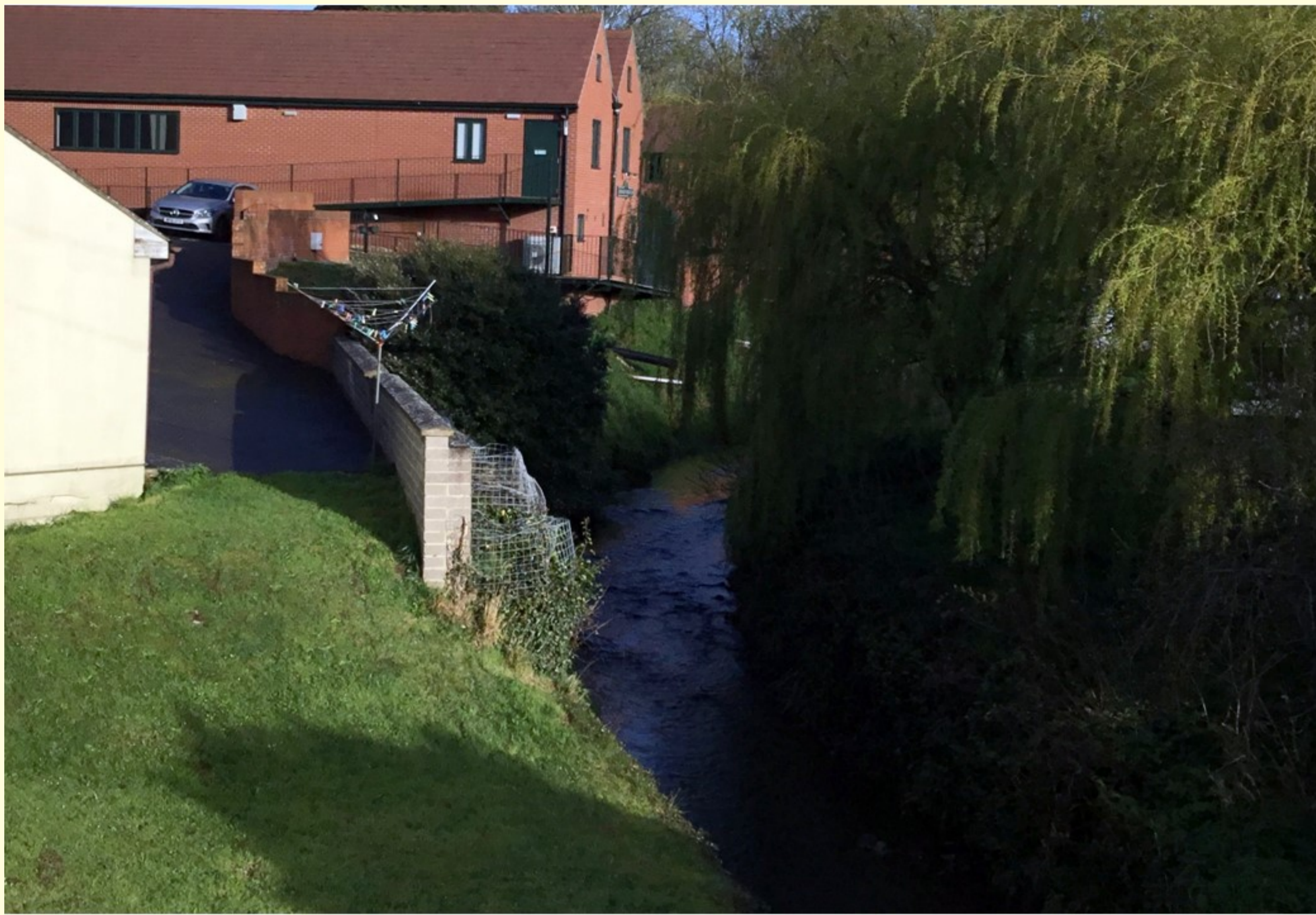
The same view today