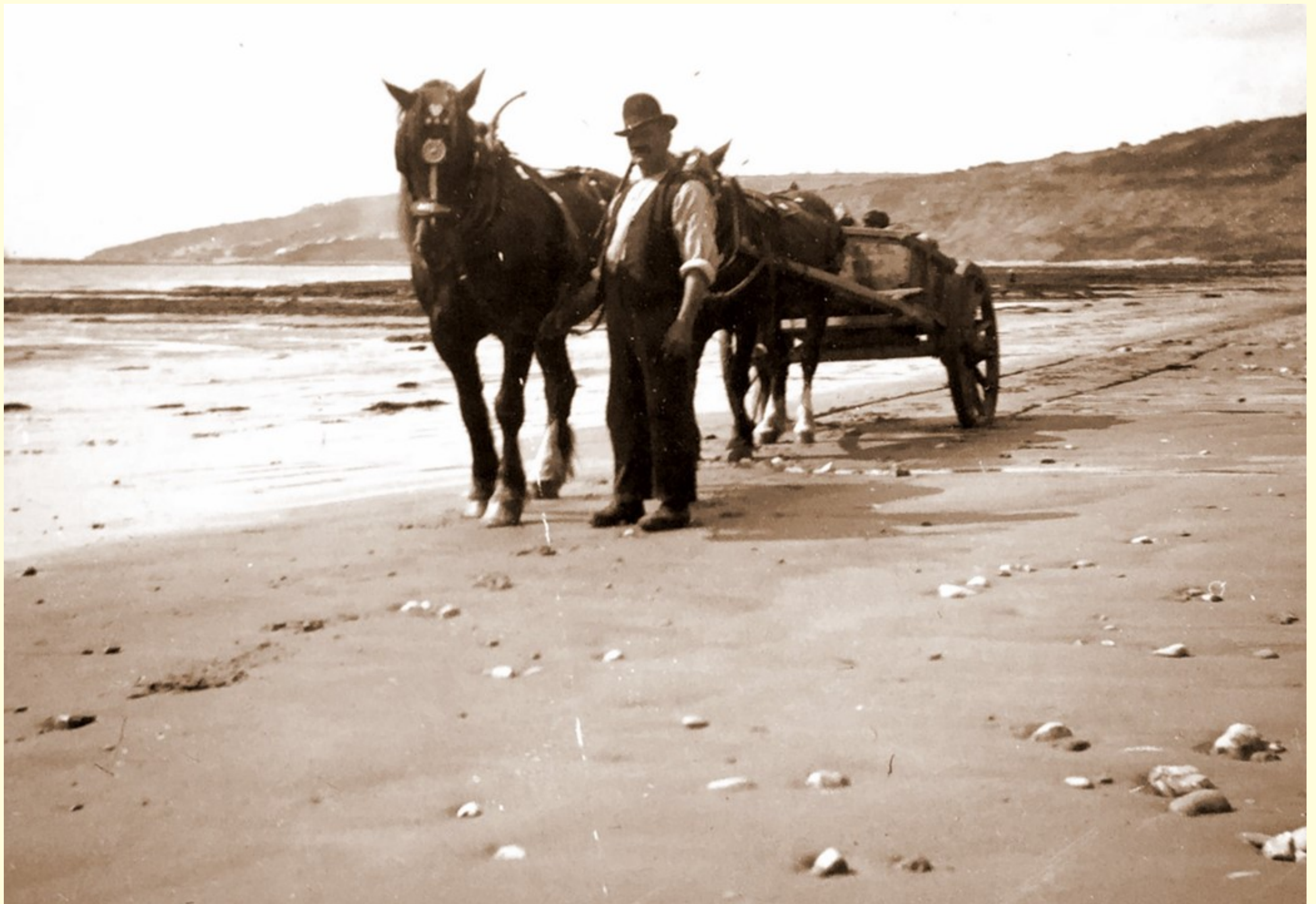
The collection of Stone, Sand and Seaweed by horse and carts for use on The Pass Estate would have been a familiar sight in Edwardian times.