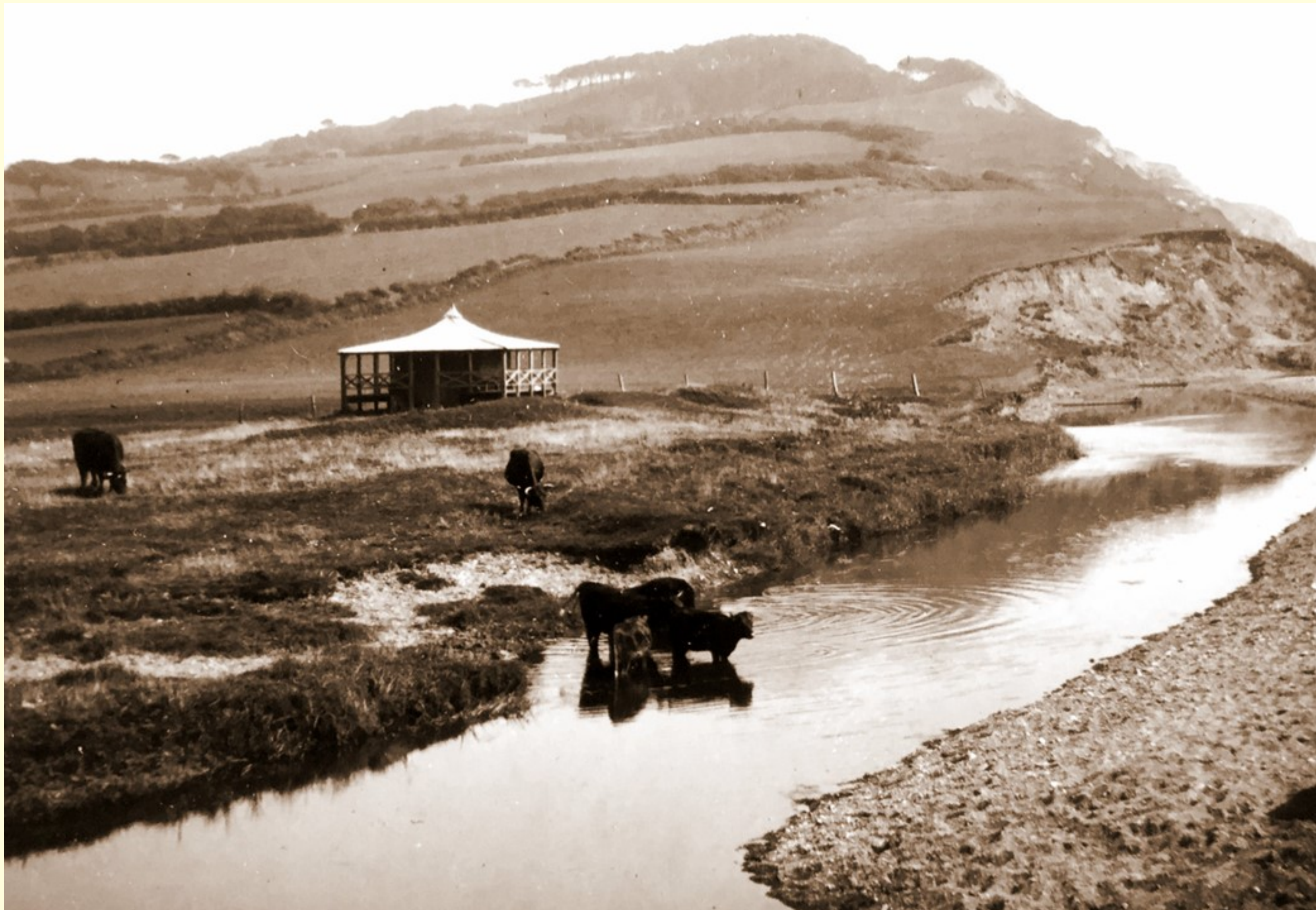
A close up of The Jubille Shlter which was created by constructing covered seating around the former Battery where ammuniton was kept by the local Reserves whose cannons were on the beach where the Car Park is today.