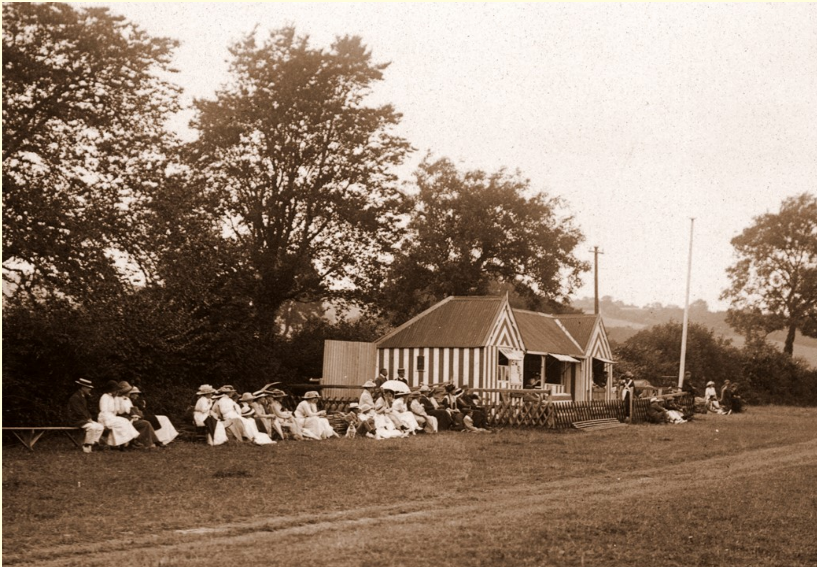
The Cricket Pavillion which was erected in 1904 is seen here with villagers watching a Match. A highlight of the year was the men verses the women match.