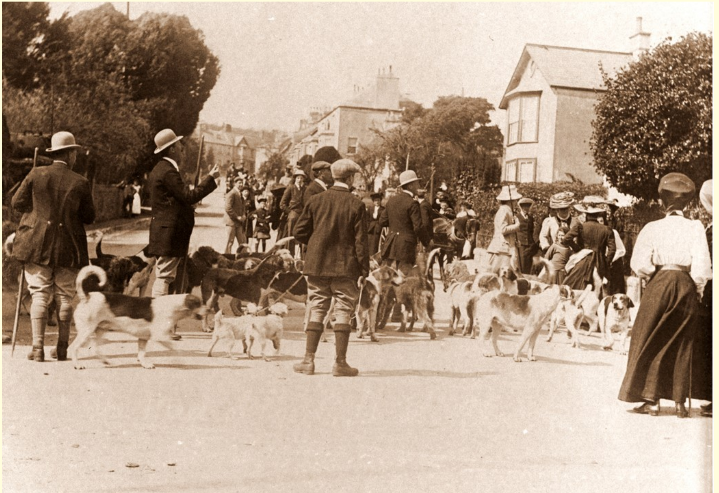
The Cotley Harriers are seen here outside the Coach and Horses where they used to meet before moving to the New Inn further up the hill. They are still active today. The tall building in the centre was Backlands Dairy House and now called Hardings.