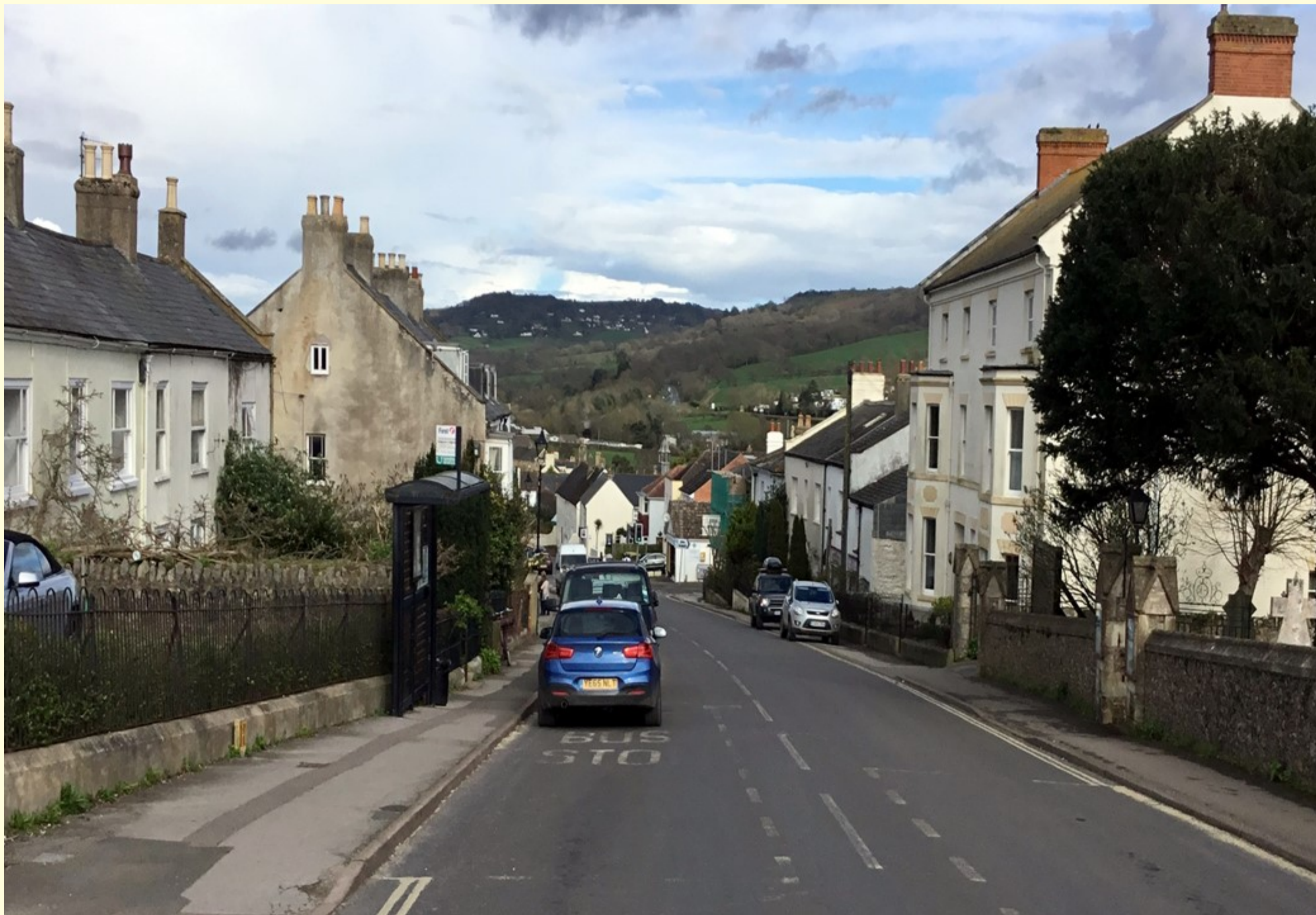
The same view today

It is interesting seeing the large number of people standing in the middle of The Street at that time before the age of Automobiles put a stop to it. The village Policeman is shown coming towards us. The gentleman in the boaters are standing behind the iron railings of The Manor, opposite the Church.