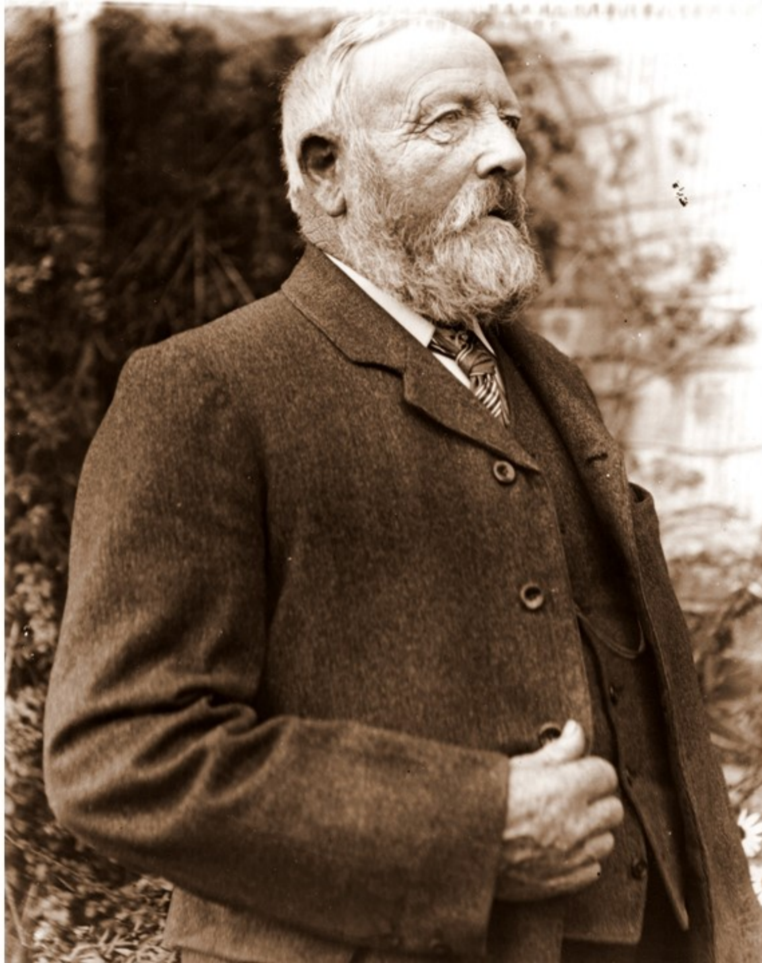
Jim Hawker worked in Lower Sea Lane as a Wheelwright on a site where the Hensleigh Hotel is today.