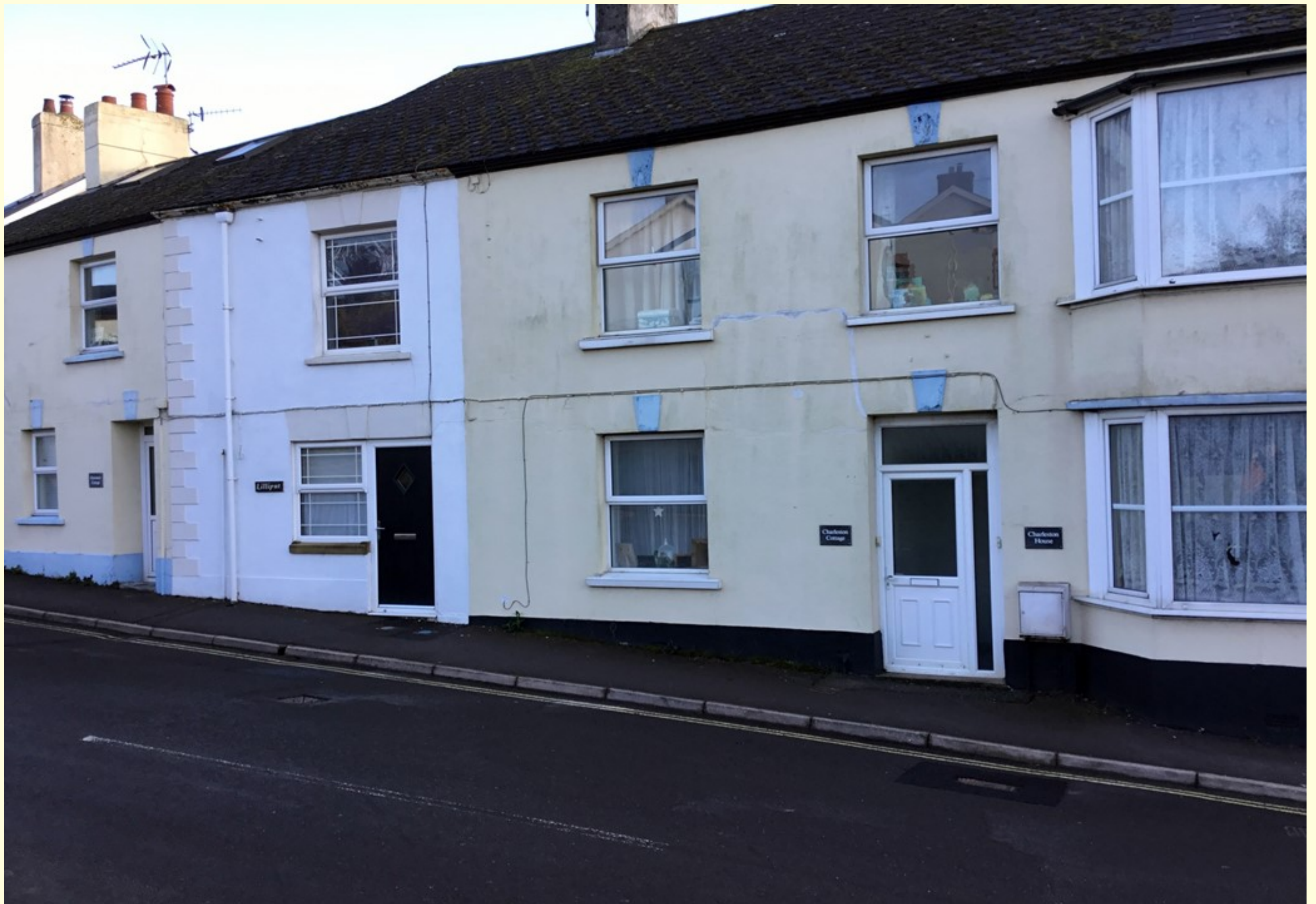
The same view today with the previous Inn now subdivided into three houses.

The former picture has this marvellous companion showing more of the New Inn with its regulars posing for the camera outside its ivy clad front. The young chap on the left is standing by an advert for Stones Axe Vale Cider on the junction of Old Lyme Road.