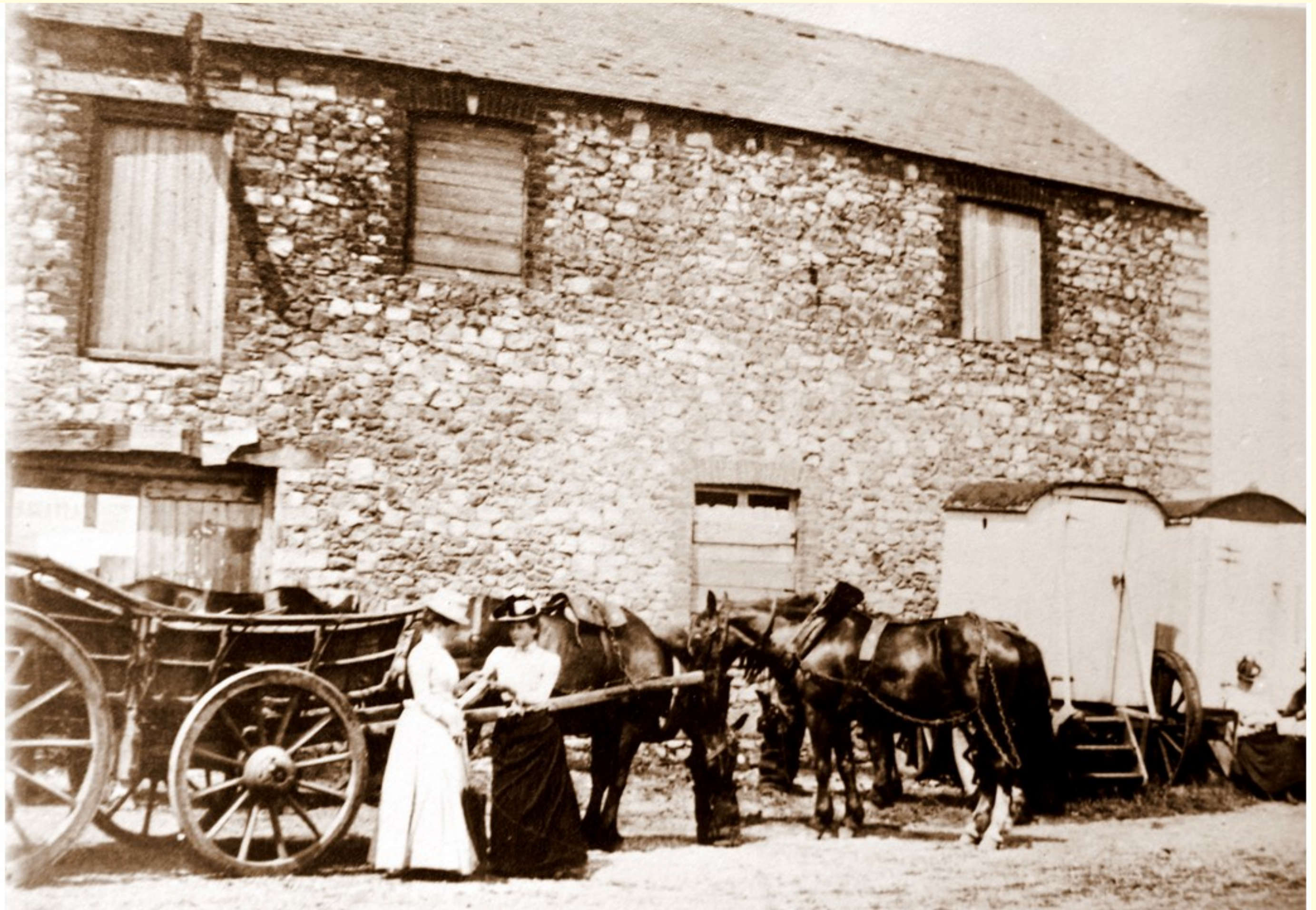
The former Cement factory was used by the Hunters for storage of their fishing nets and Bathing Machines. Two ladies are standing by one of the Horse and Carts that were filled with sand, stone and seaweed which was used by The Pass family who owned the buildings and 65 acres around them.