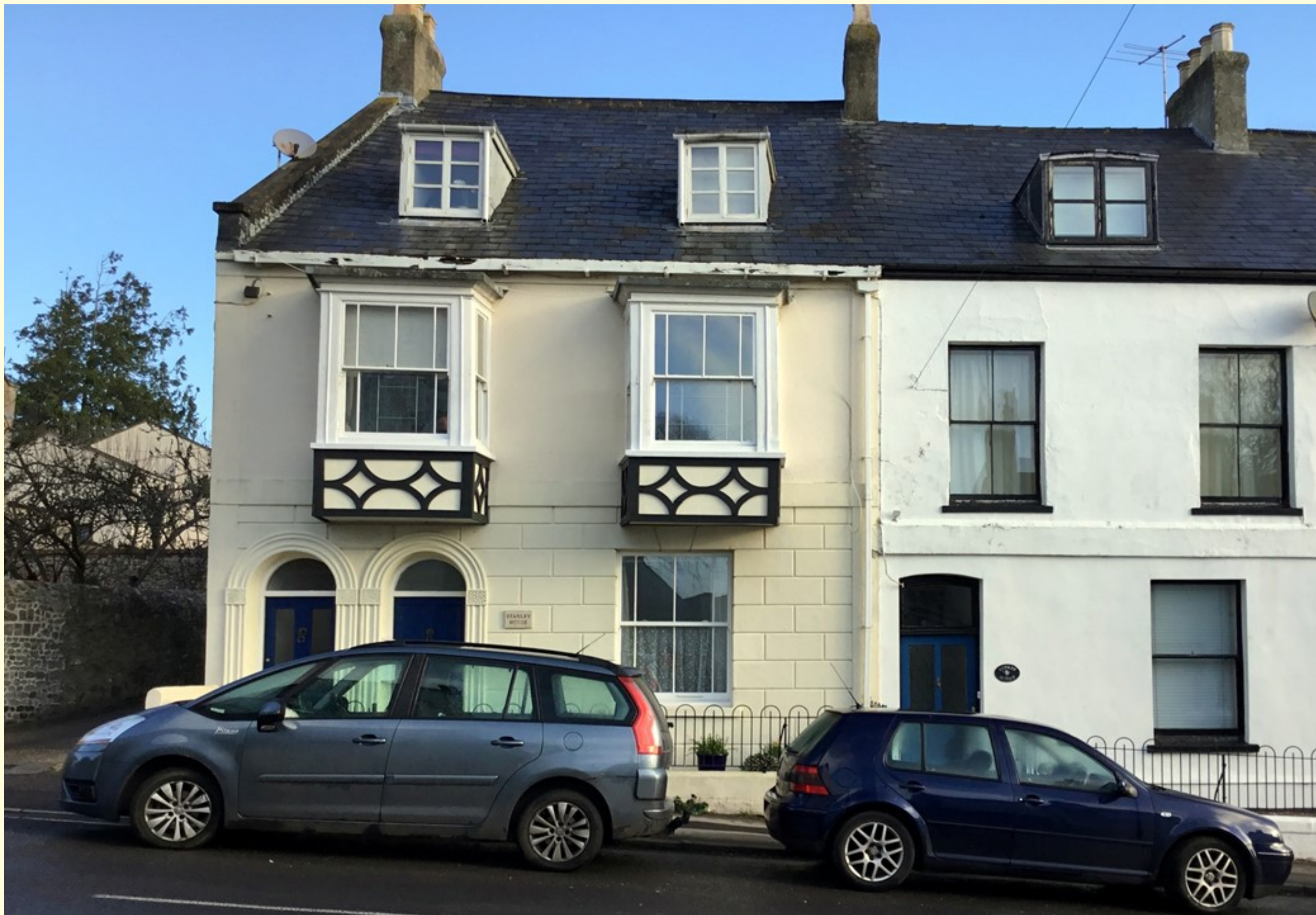
The same view today