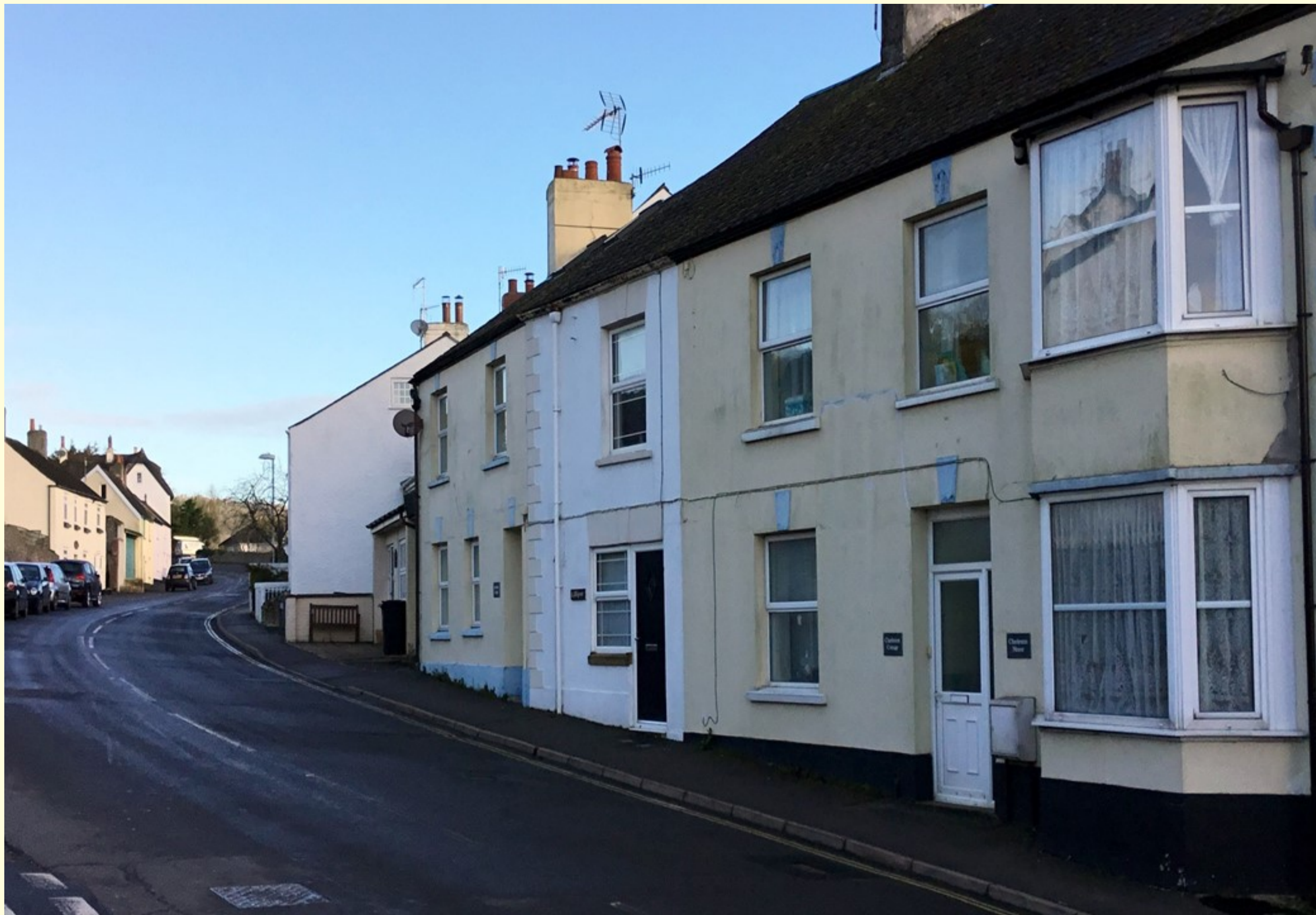
The same view today

Another view of the New Inn which was to close in the 1980s. The building shown here replaced a former premises lost in a fire in 1885.