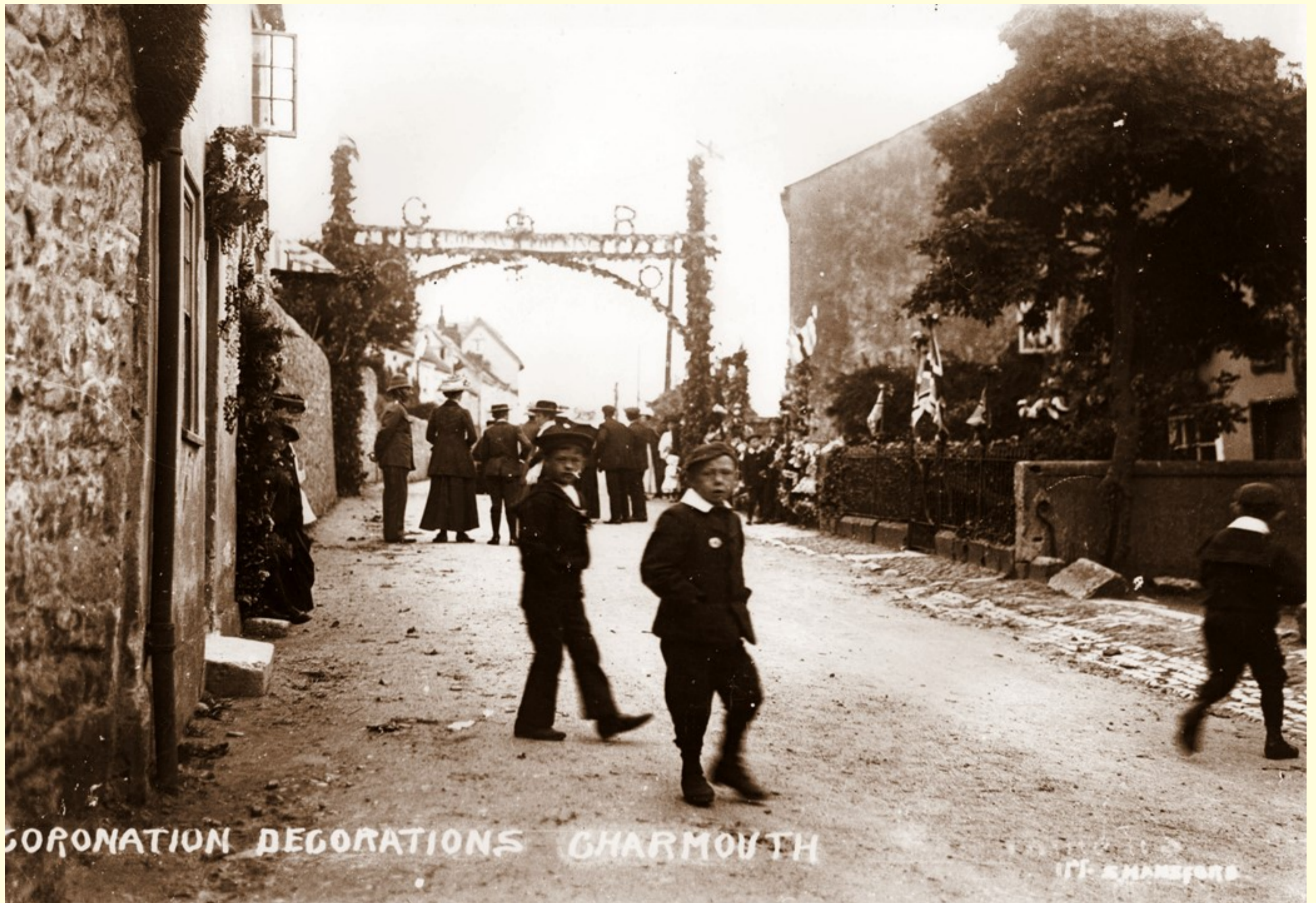
This view is taken up the Street towards the Axminster Road. The cottage on the left was demolished to make way for a car park for the New Inn opposite, but was later incorporated into the widening of the Street and is now by the bus stop there.