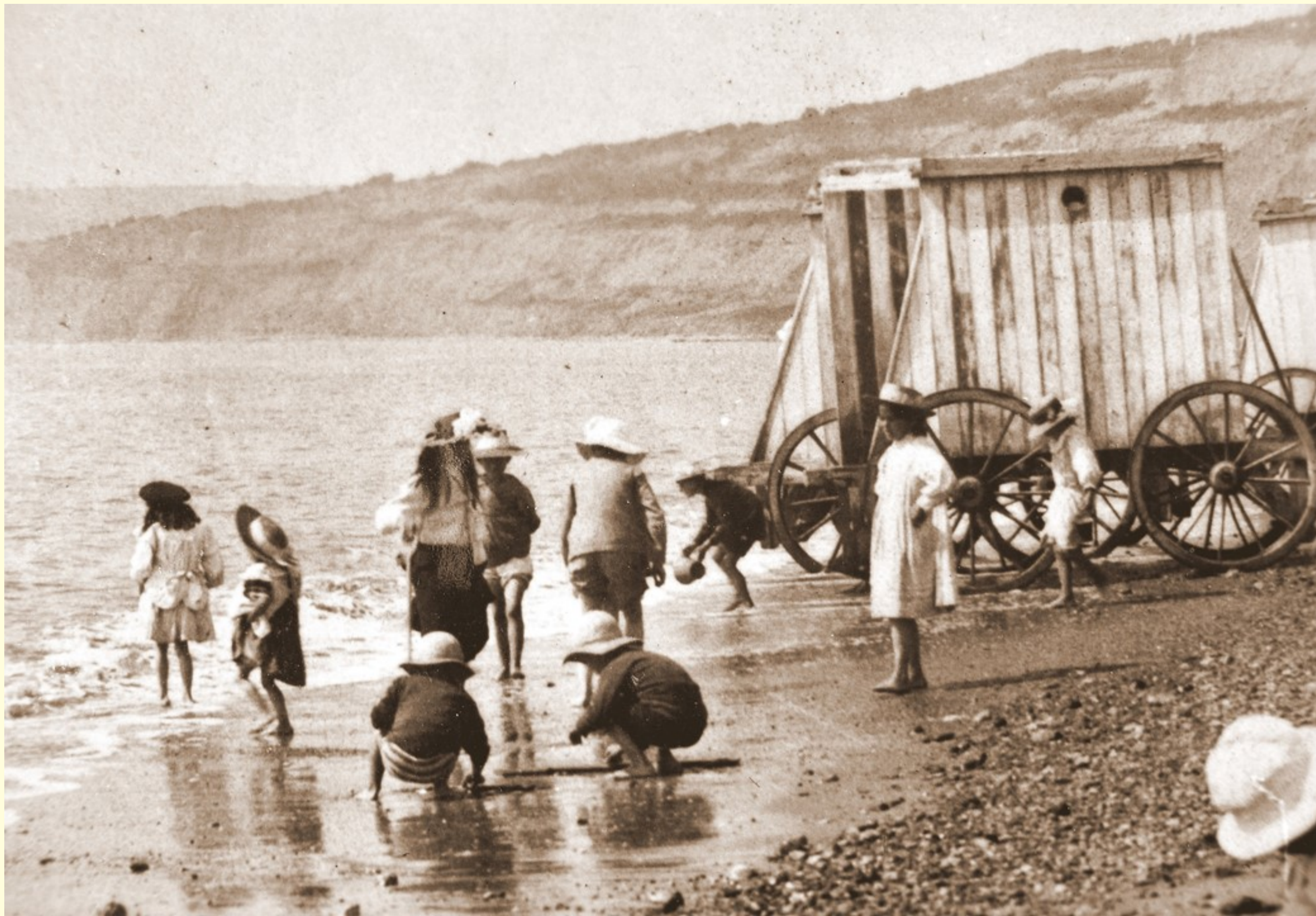
The massive Bathing Machines which allowed privacy are seen here behind a group of young children.