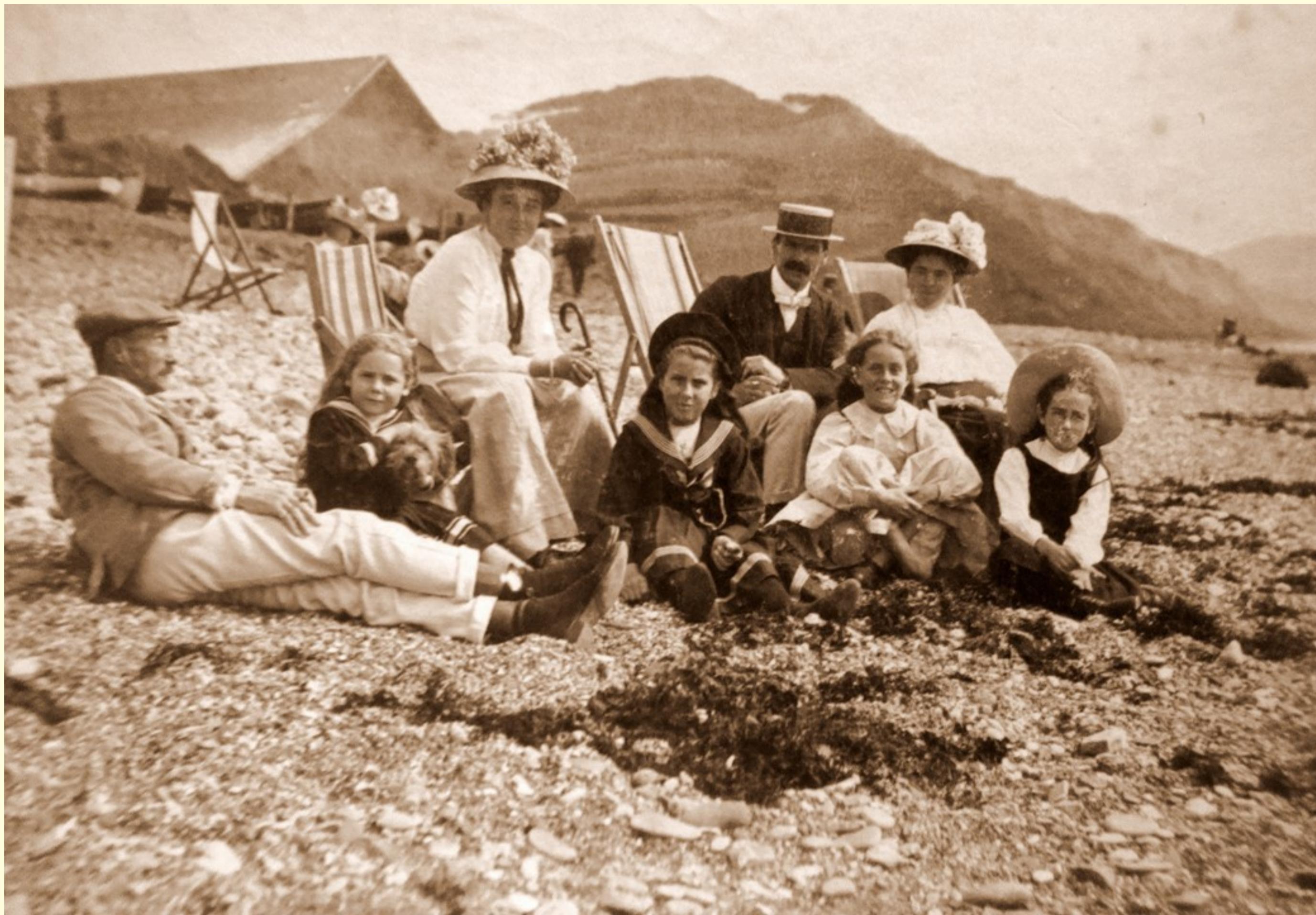
A family of Holiday makers smile for the camera in 1908.