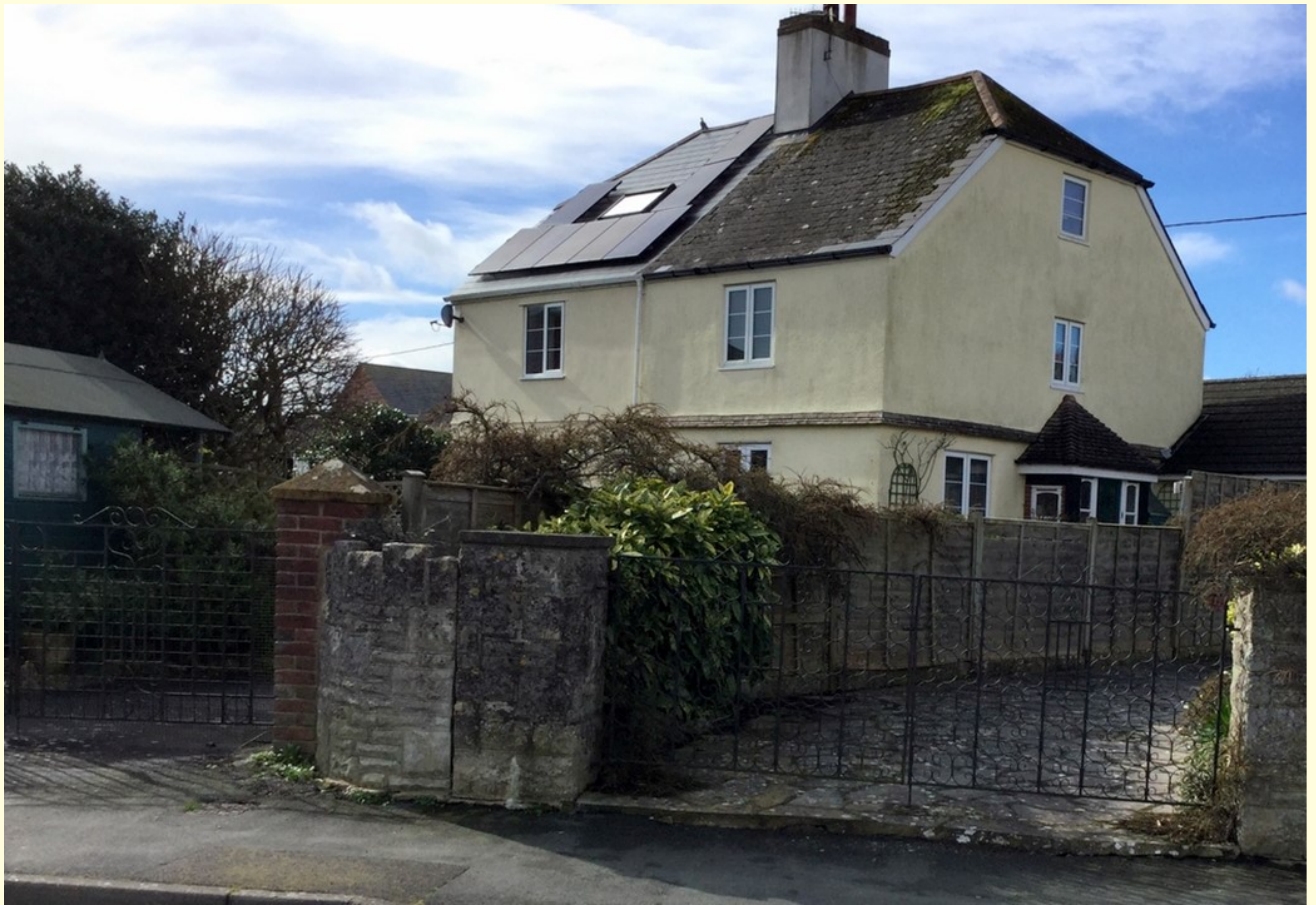
The same view today