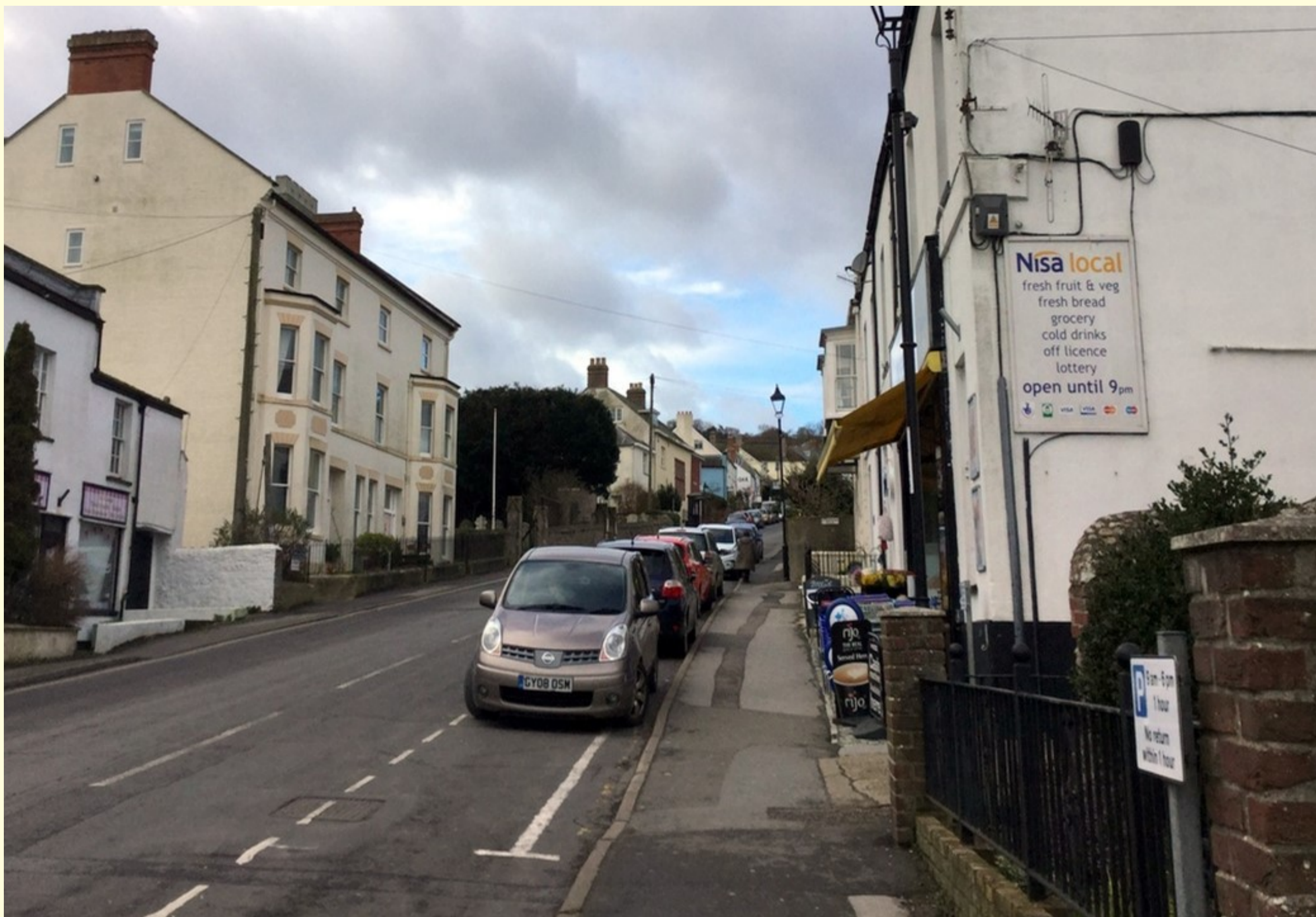
The same view today