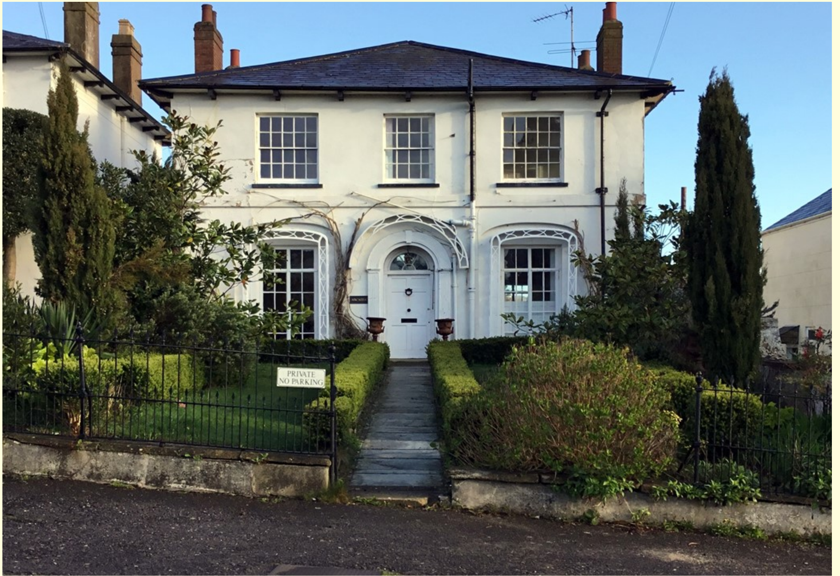
The same view today

A resplendent number 1 Hillside festooned with bunting commemorating King George V Coronation in 1911. The Templer Family lived here for many years.