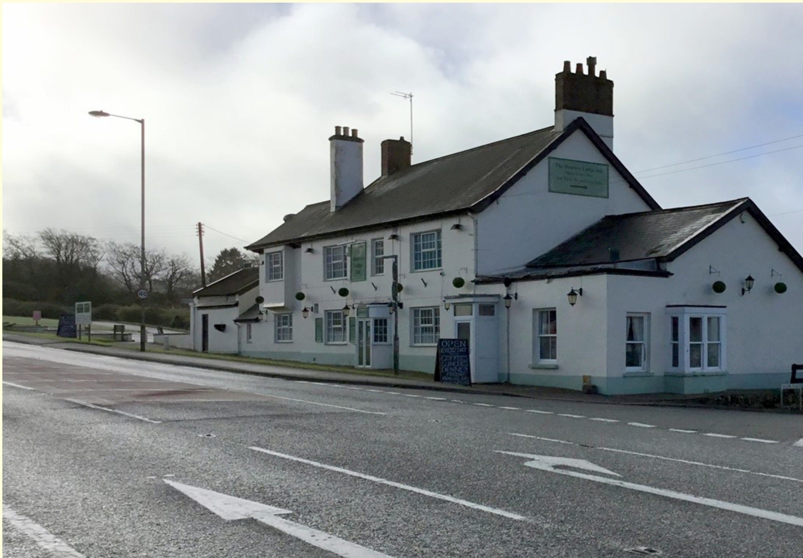
The same view today with the usually busy road passing alongside it.