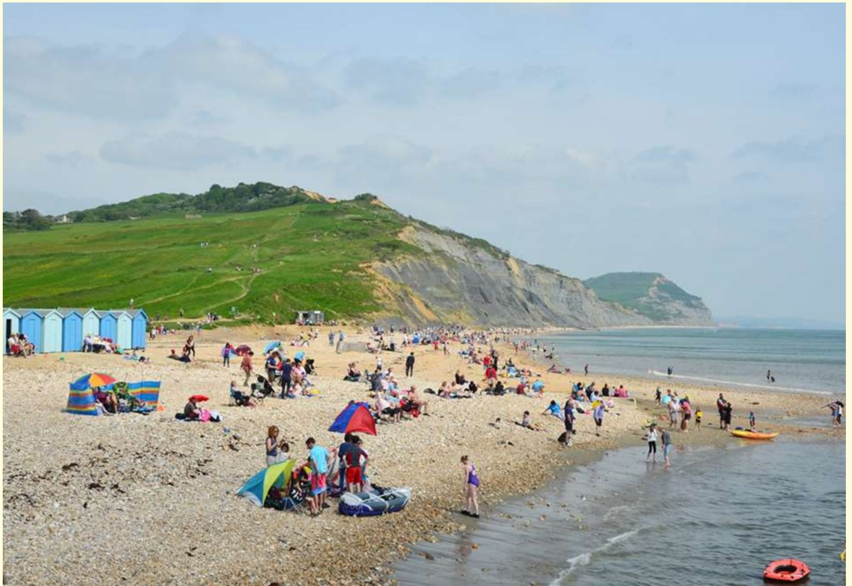
The same view today