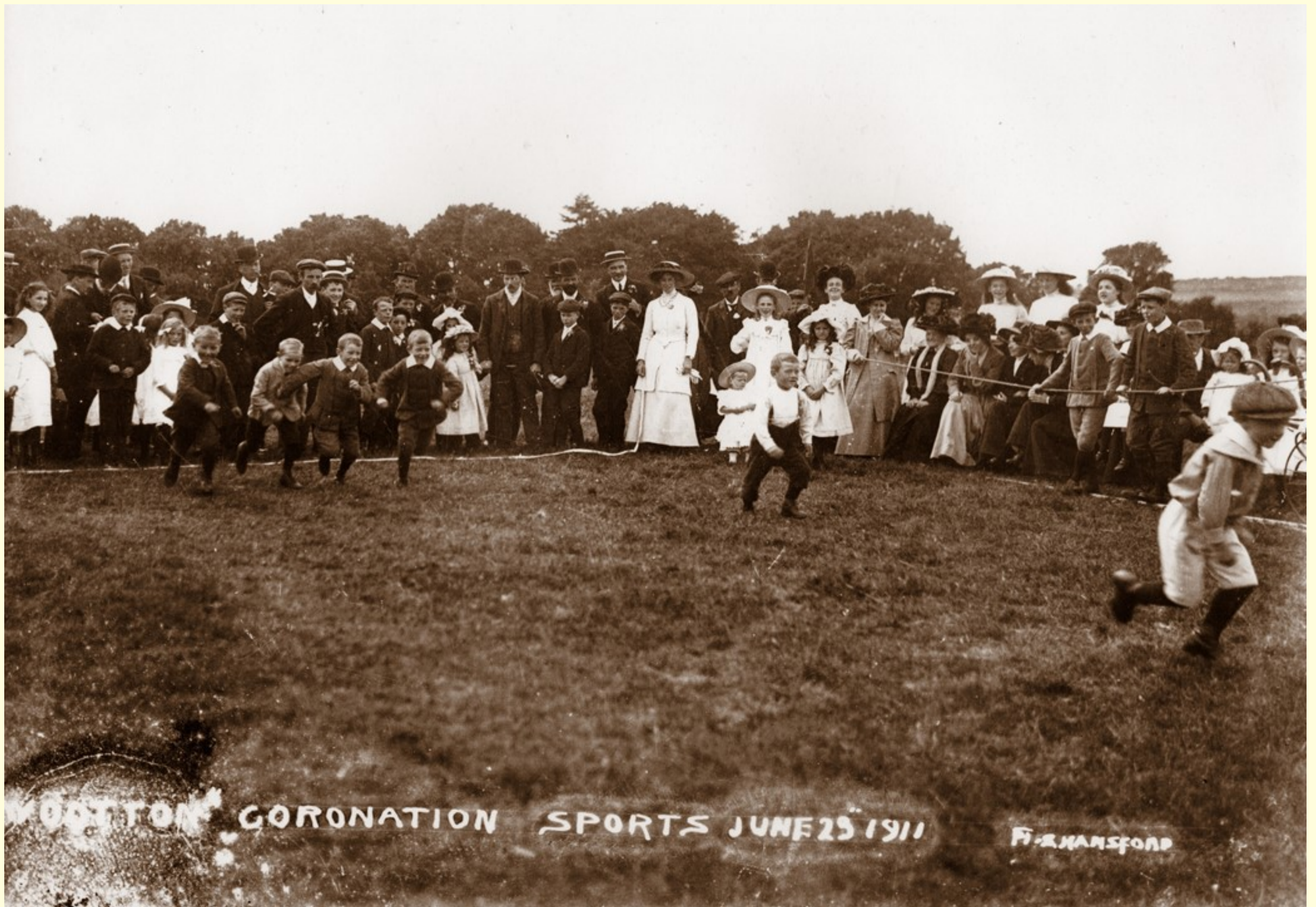
Children enjoying a Race on the Playing Field