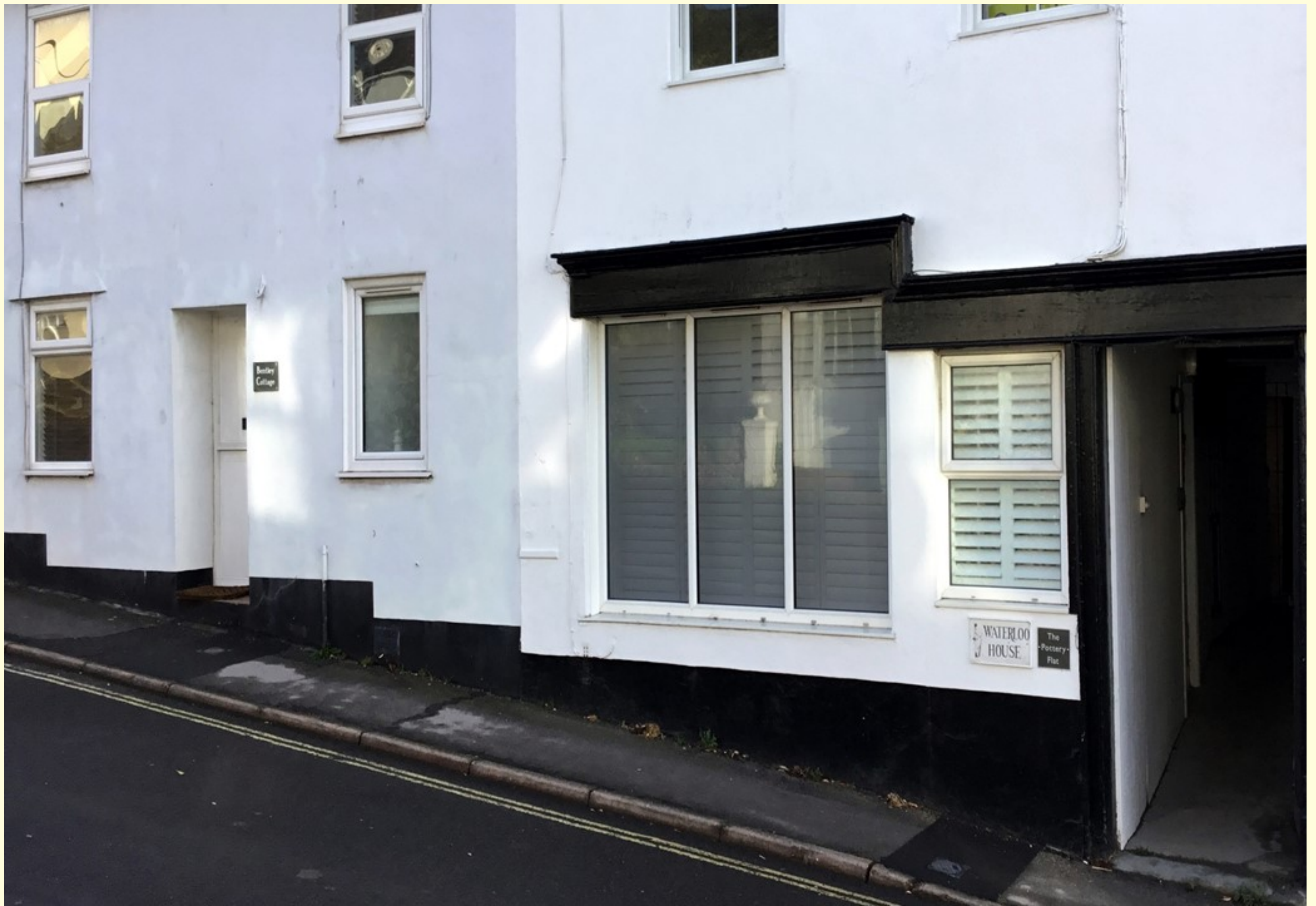
The same view today

This fine view is of Childs Hardware and Blacksmiths shop with the family lined up outside. This is where Waterloo House and the Fossil Shop are today.