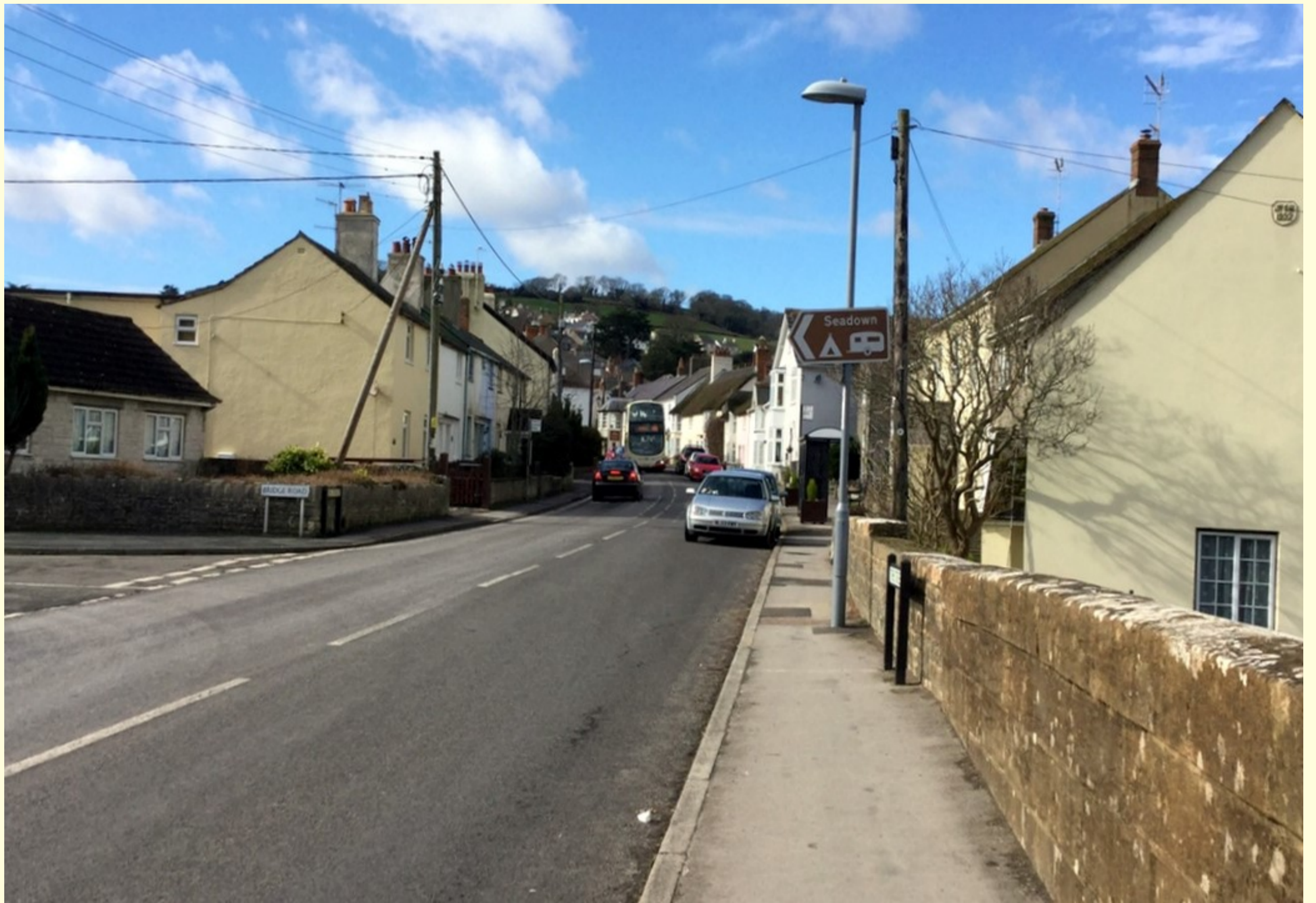
The same view today