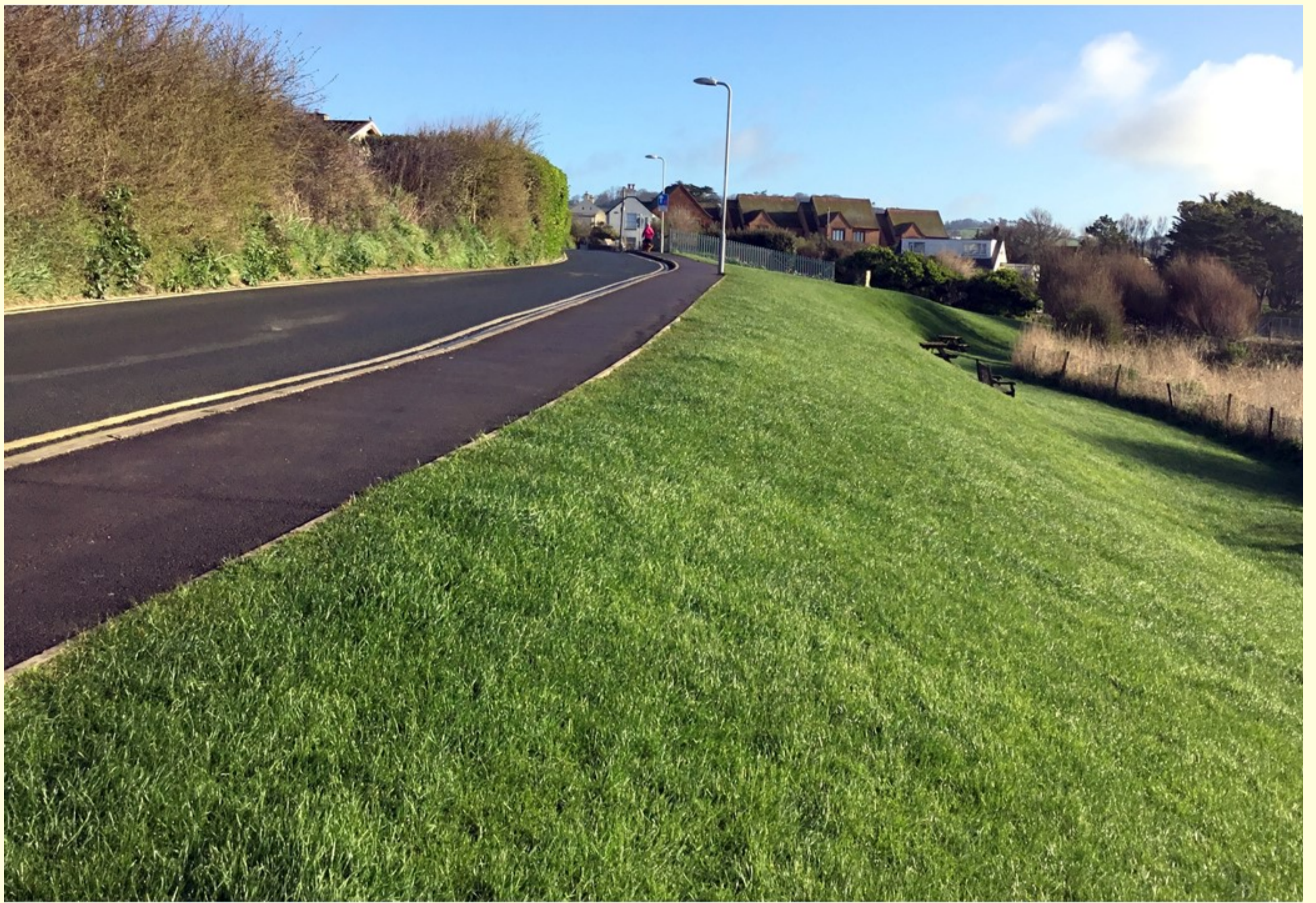
The same view today