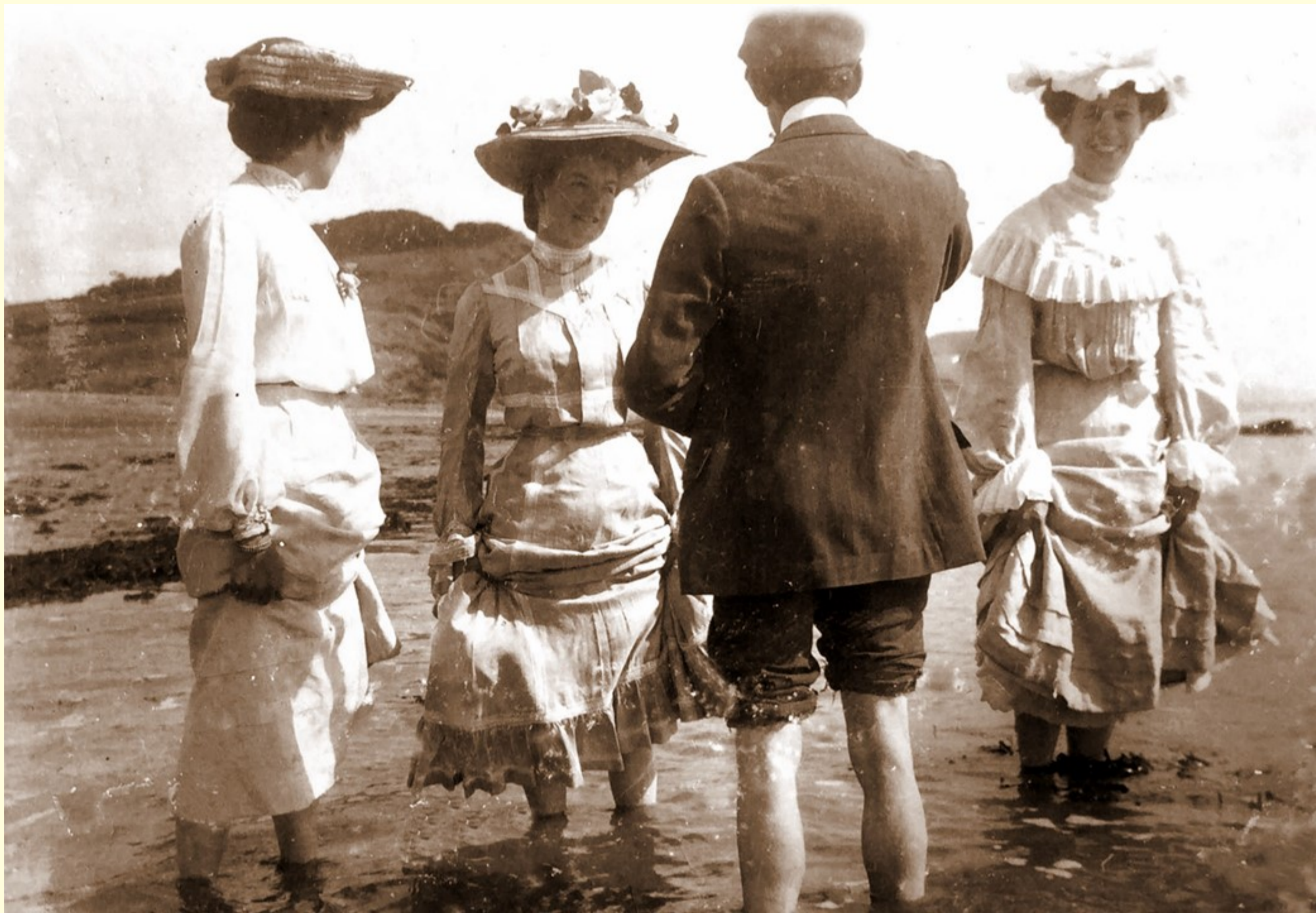
A close up of the same Bathers.