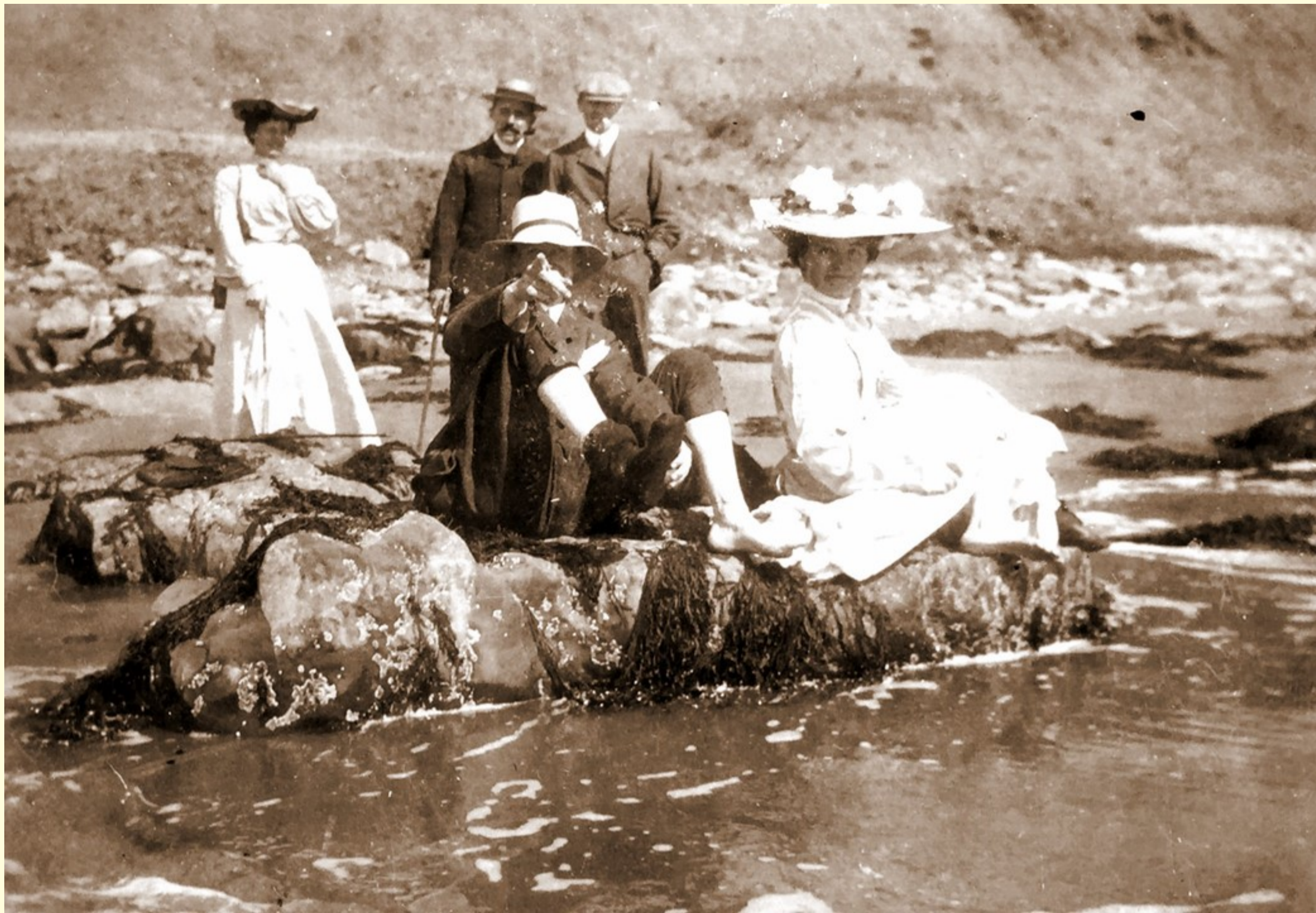
There follows some candid photos of a group of villagers in 1908