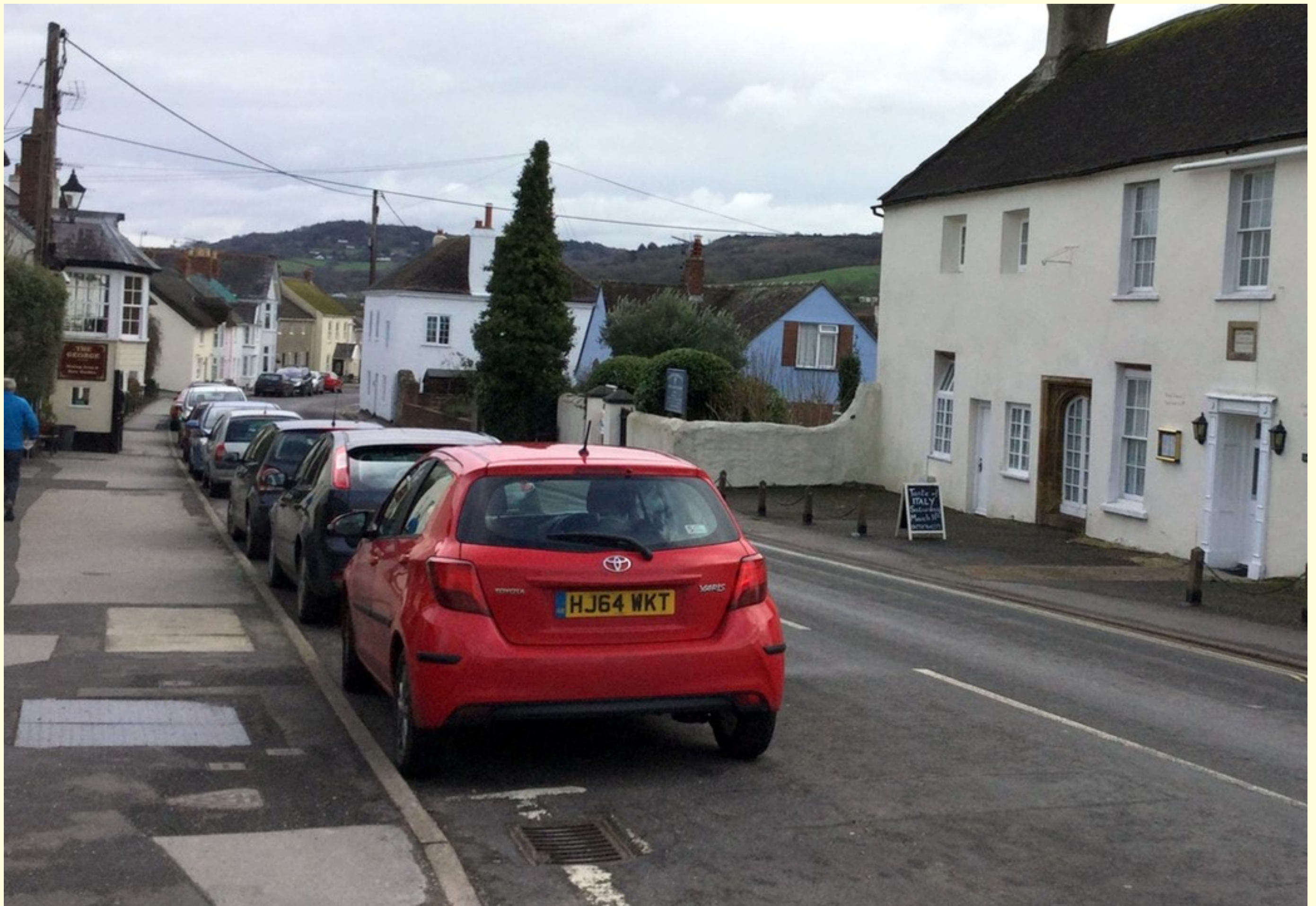
The same view today

The Procession is passing The Queens Armes" on the right, where King Charles II stayed for one night in 1651 during his unsuccessful attempt to flee the country for France.